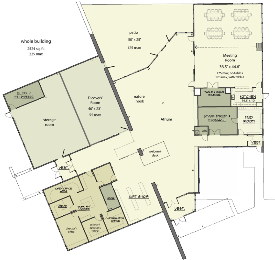
EXHIBIT "B" Floor Plan