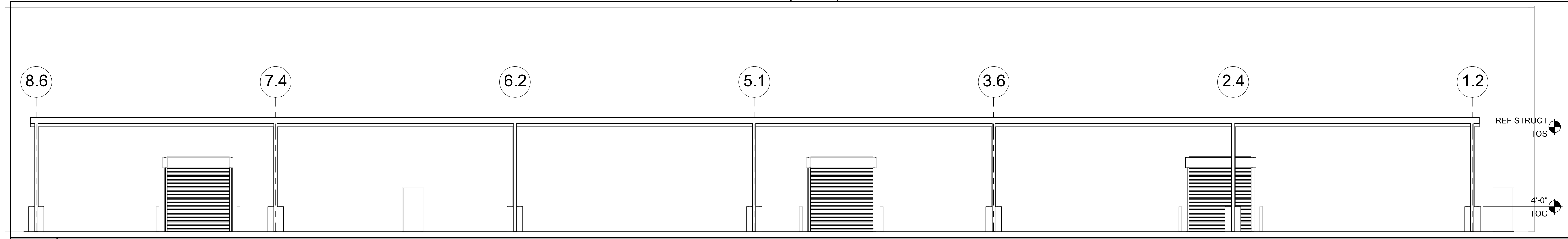
C4 CANOPY ELEVATION - NORTH 1" = 10'-0"