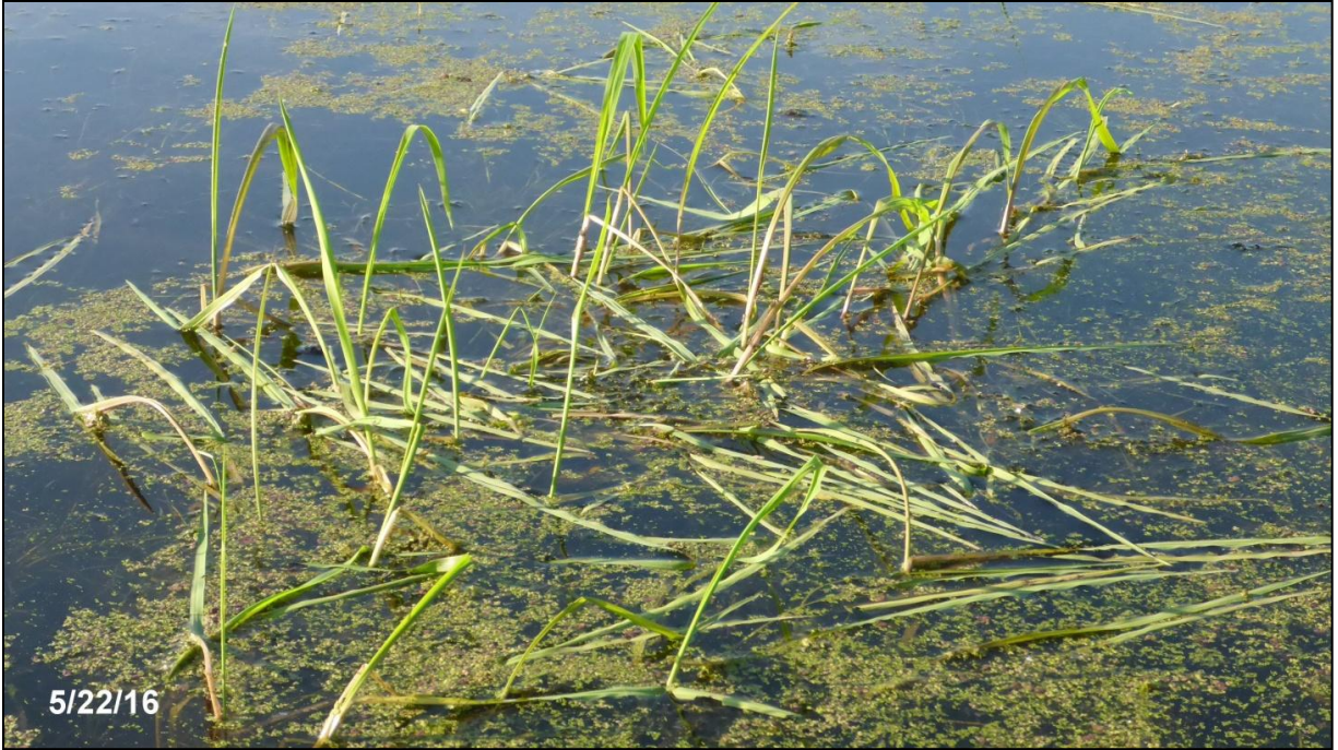
Photo 2. A closer view of wild rice on May 22, 2016.