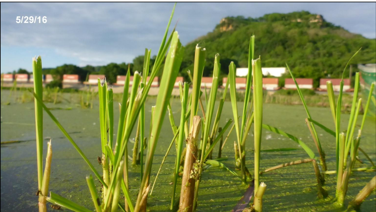
Photo 3. Evidence of heavy foraging of wild rice on May 29, 2016.