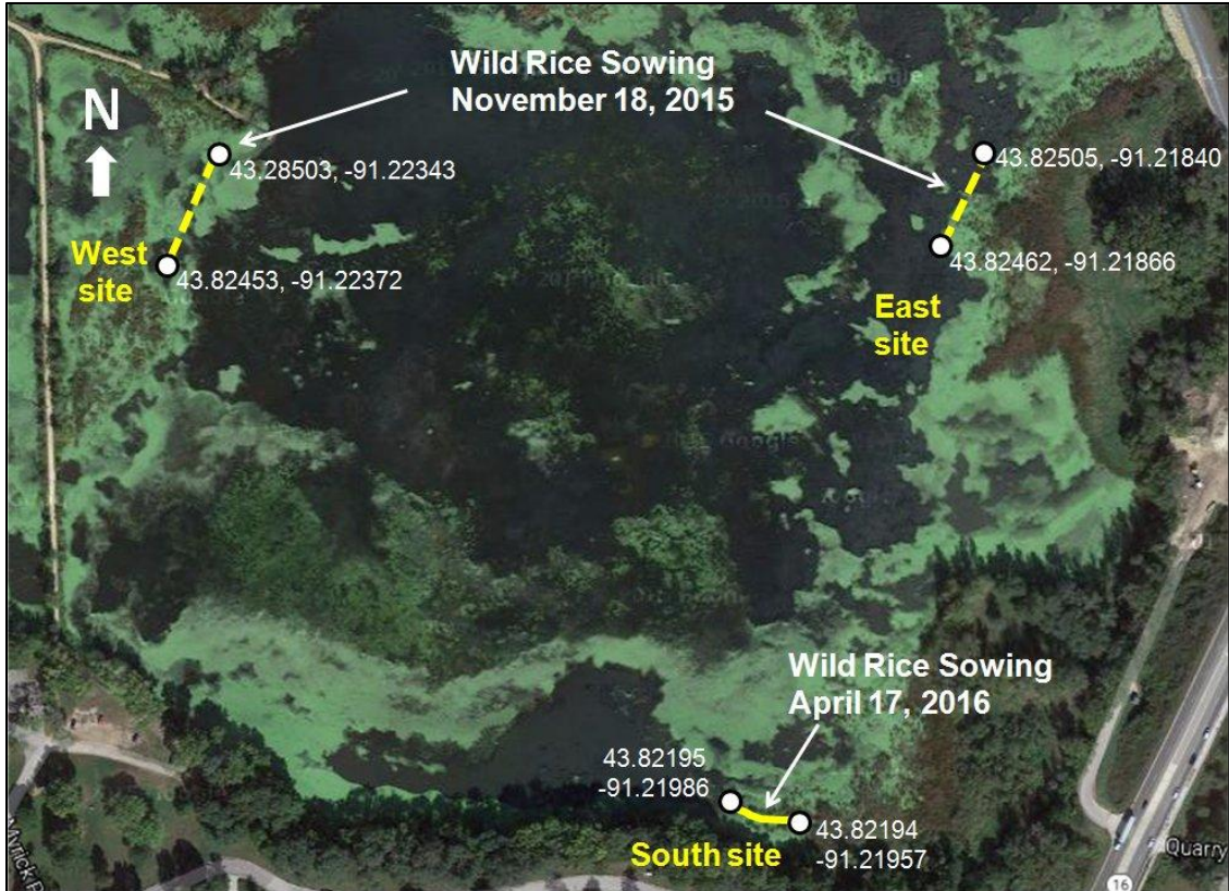
Map 1. La Crosse River Marsh showing wild rice sowing dates and locations. Start and ends of sowing transects are indicated by lat/lon coordinates.