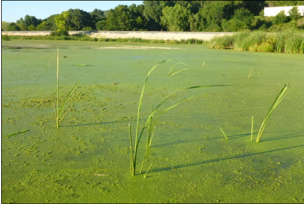
Photo 4. Wild rice growing at the east sowing site August 14, 2016.