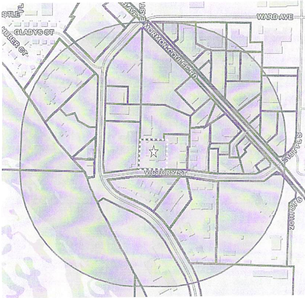
Chileda Institute, Inc. @ 1825 Victory St. – Properties within 1,000 ft Special Event Outdoor Cabaret – September 14, 2019 (noon-3)

2ND & MAIN LLC PO BOX 609 LA CROSSE, WI 54602-0609