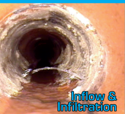
Pipe Missing & Broken

EMPIRE PIPE SERVICES UTILIZES A CURED-IN-PLACE-PIPE (CIPP) PROCESS. THIS ELIMINATES THE NEED FOR COSTLY DIGGING BY CREATING A PIPE WITHIN A PIPE WITH MINIMAL CHANGE TO THE ORIGINAL DIAMETER. THROUGH THIS PROCESS, NOT ONLY DOES OUR TRENCHLESS TECHNOLOGY CURE THE INFILTRATION, IT ALSO IMPROVES THE PERFORMANCE OF THE STORM OR SANITARY SEWER SYSTEM.