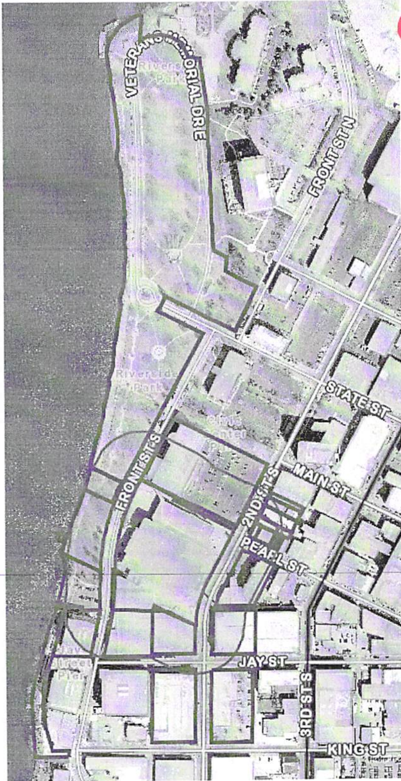
La Crosse County Convention & Visitors Bureau d/b/a La Crosse Center 200' Buffer for Class "A" Beer Garden September 8 th , 2016 Council Meeting