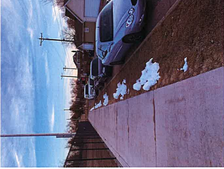
View North, further North