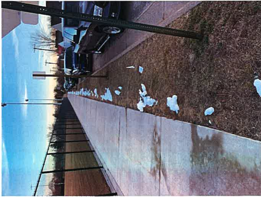
View North, closest to Playfield Lane

New, black acorn style walkway lights, approximately 50ft on center. Base 12" from sidewalk.