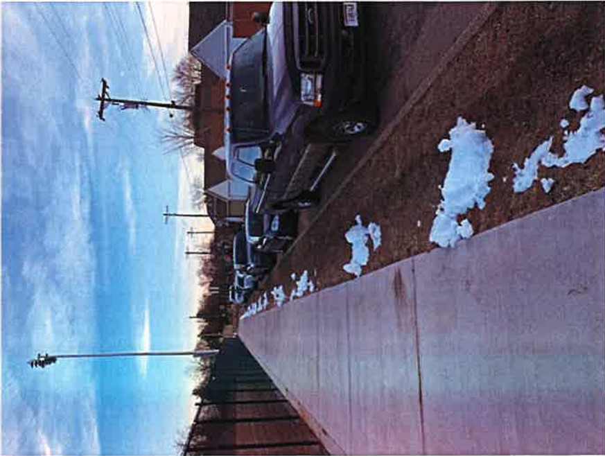
View North, further North