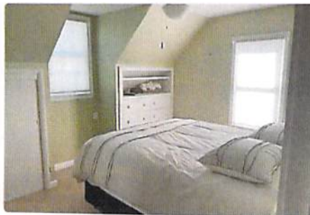
Bedroom 1 1 king bed