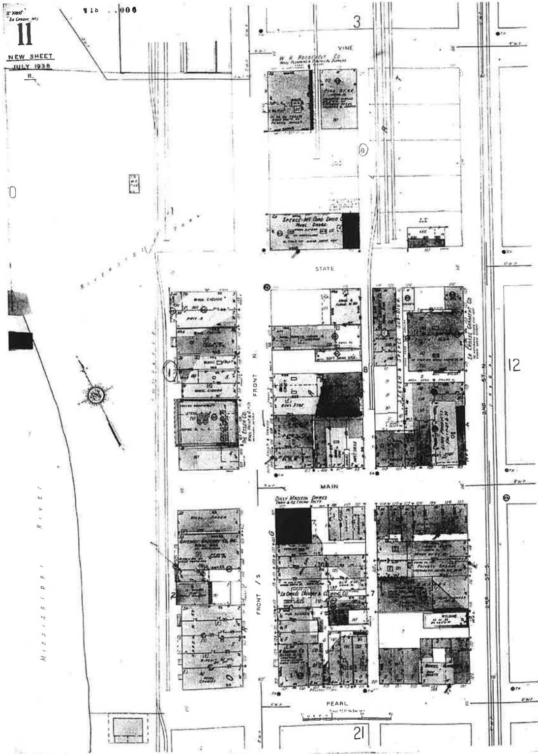
Figure 2: 1936 Sanborn Fire Insurance Map, page 11, Walter Anderson Bandshell would be somewhere between State and Pine Streets on or close to the left edge of the map.