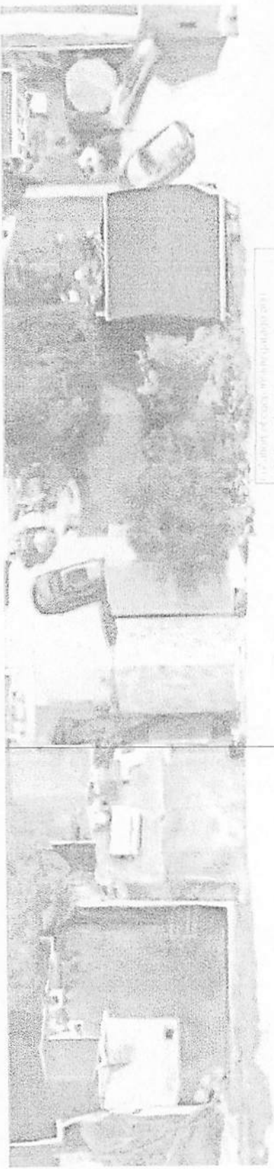
12. Aerial view of the development showing the central green space.