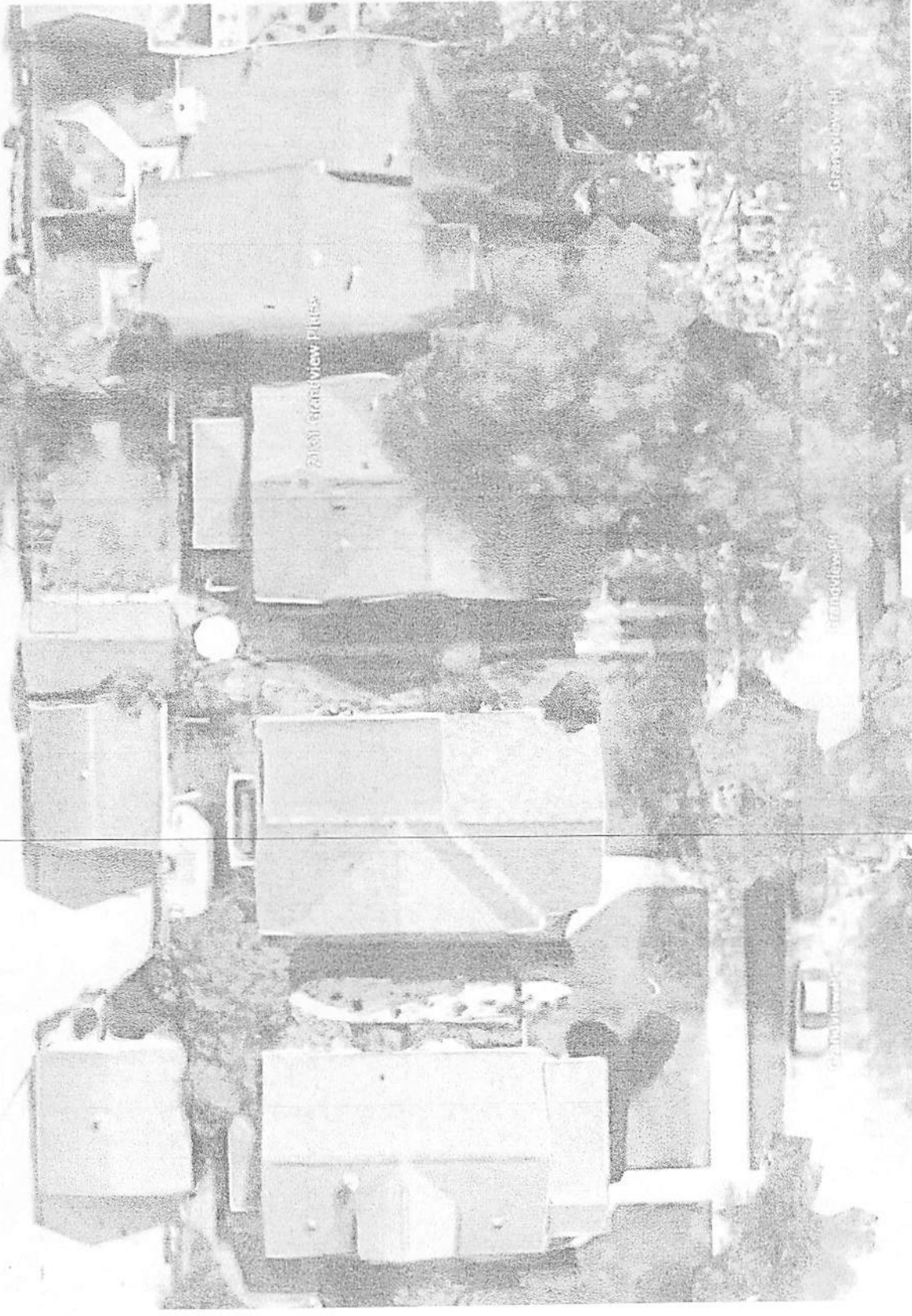
13. Aerial view of the development showing the central building.