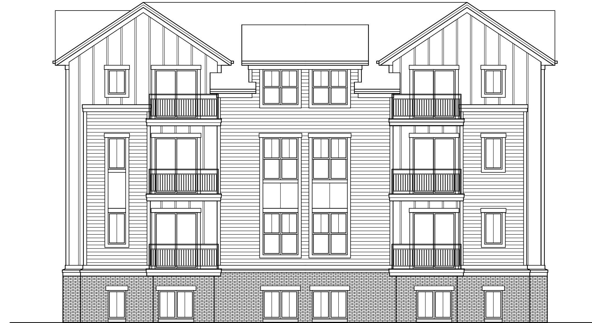
2 FRONT ELEVATION A-1.1 1/8" = 1'-0"