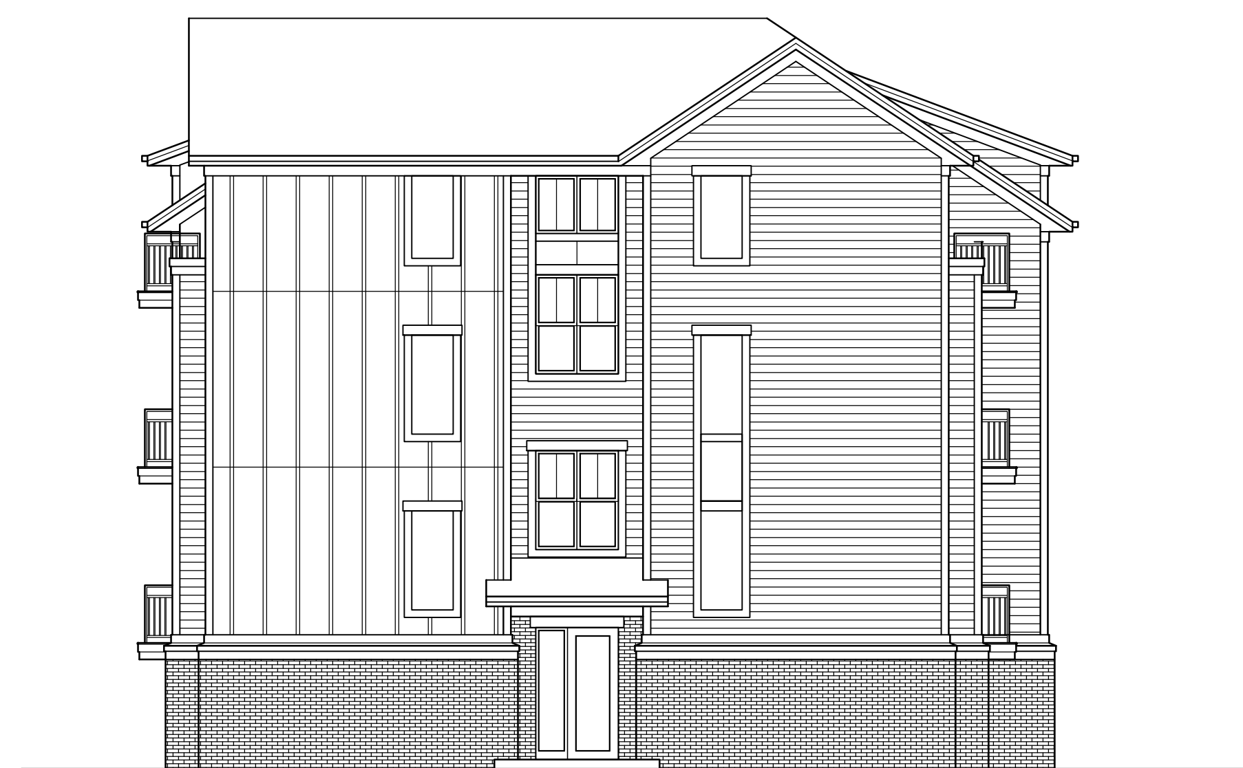
3 SIDE ELEVATION A-1.1 1/8" = 1'-0"