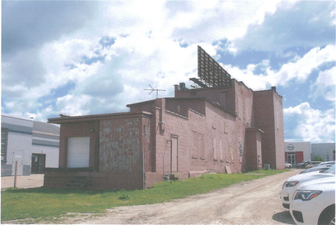
520 Third St. S., south façade (side) and west façade (back), facing northeast.