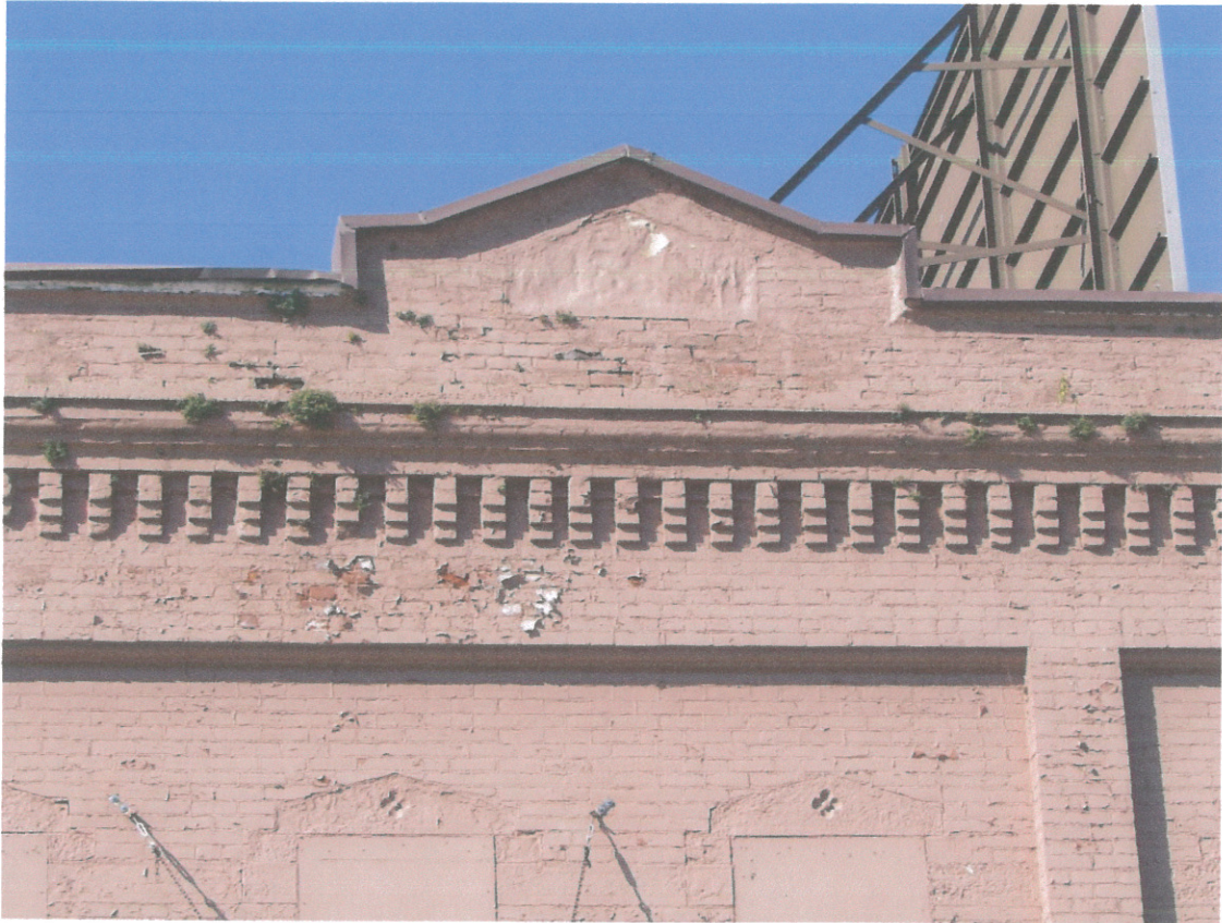
520 Third St. S., showing east façade detail, second floor window lintel details, brick corbeling and pedimented cornice. The stone inset into the pediment appears to be a date stone, as "188x" is slightly visible. It may have been covered with plaster or concrete.