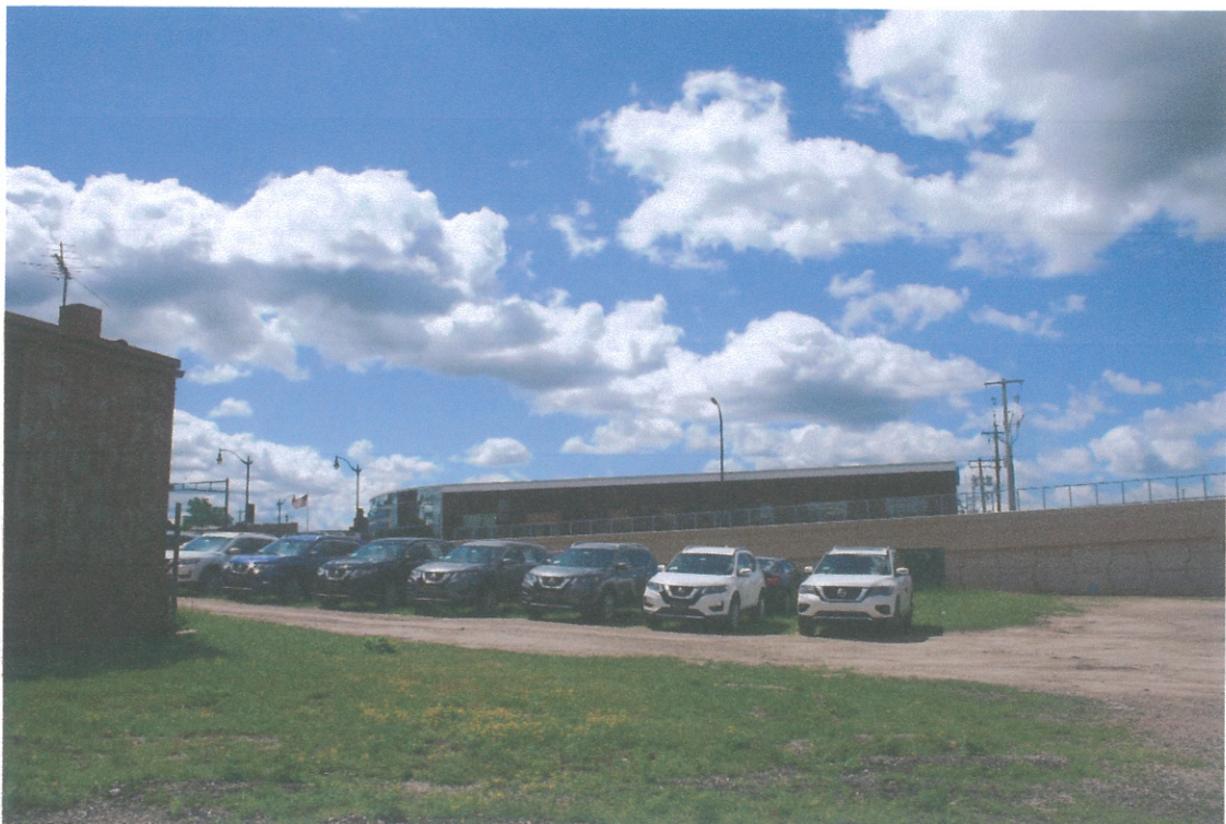
From back of 520 Third St. S., facing approach abutment of Cameron Street Bridge, facing south