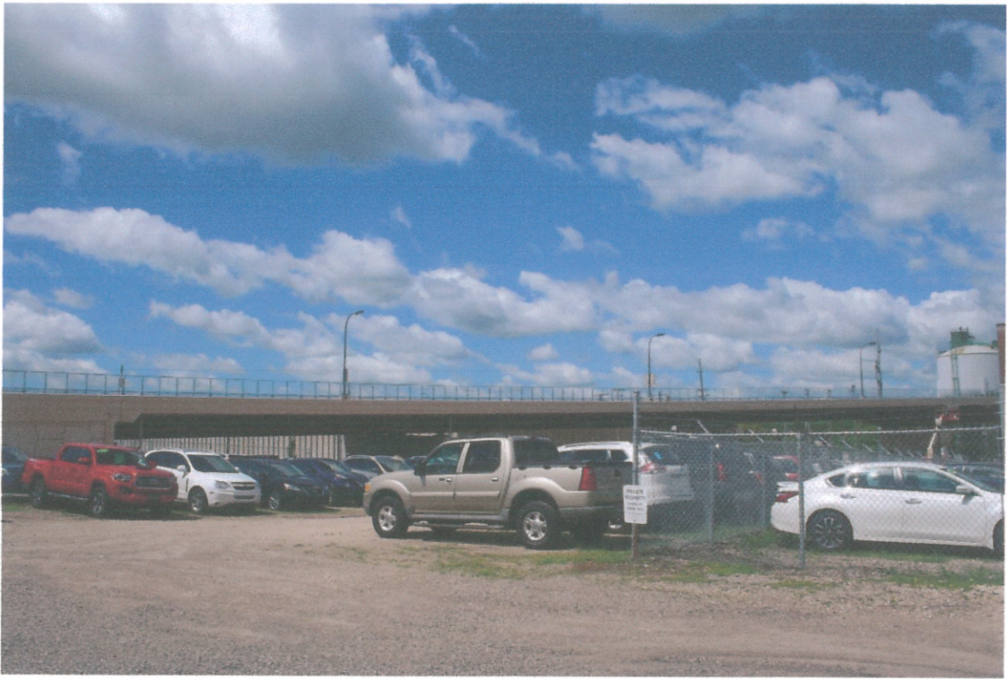
From back of 520 Third St. S., facing south toward Cameron Street Bridge.