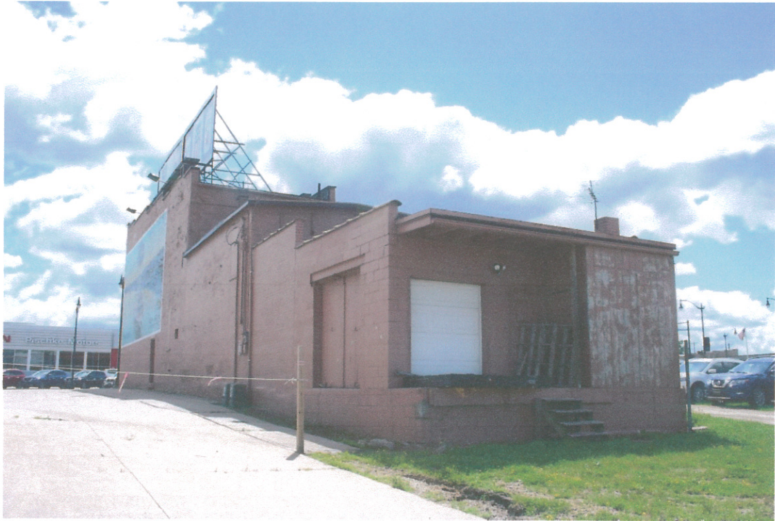
520 Third St. S., west (back façade) and north (side) façade, with mural of War Eagle. Facing southeast.