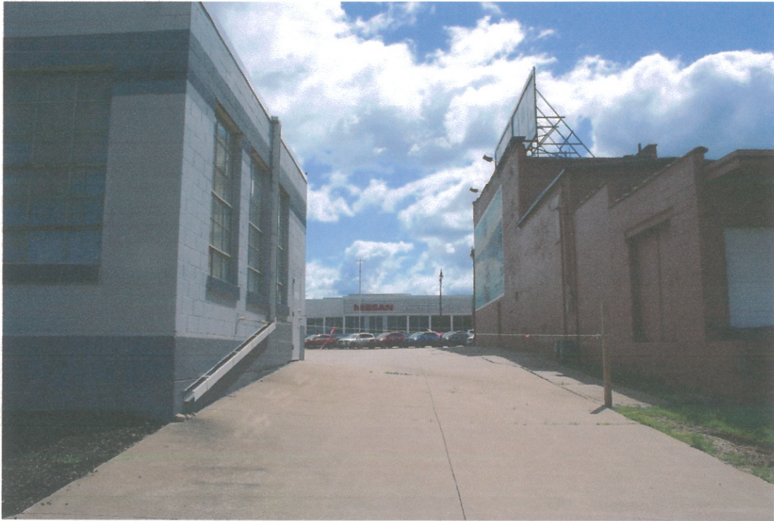
From back of 520 Third St. S. in alley to north of building, facing toward Third Street/Pischke Motors on east side of street.