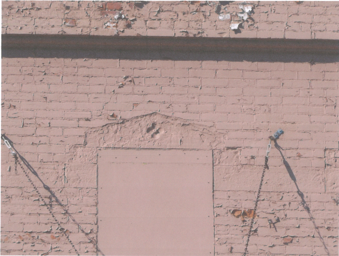
520 Third St. S., east façade detail, showing second floor boarded window, with original stone lintel and lintel decoration.