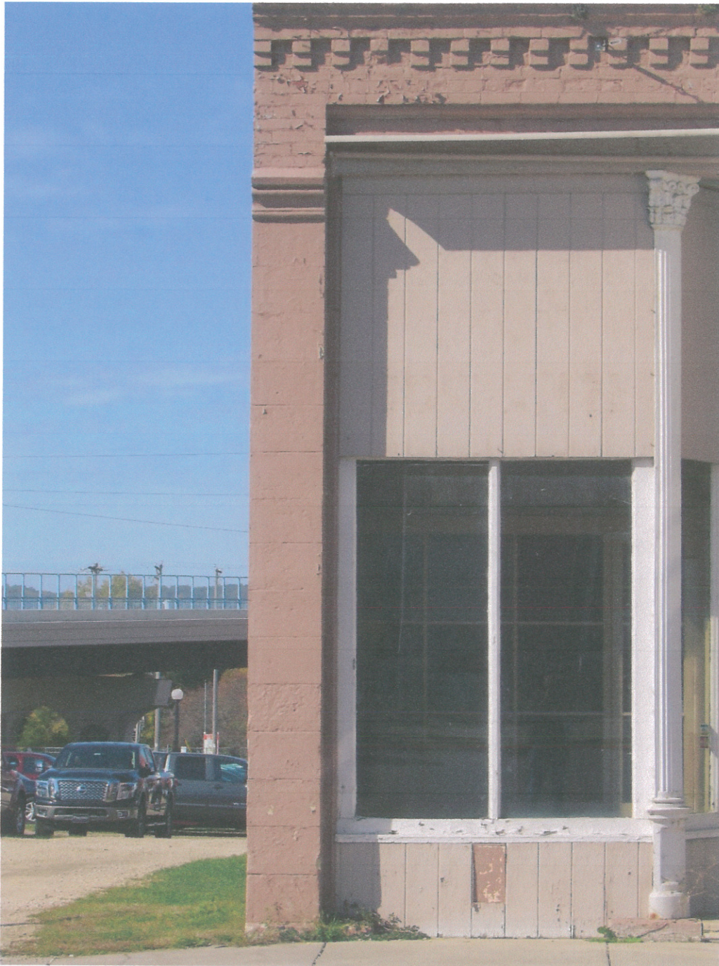
520 Third St. S., east façade detail, showing limestone corner post, original window and cast iron entrance post.