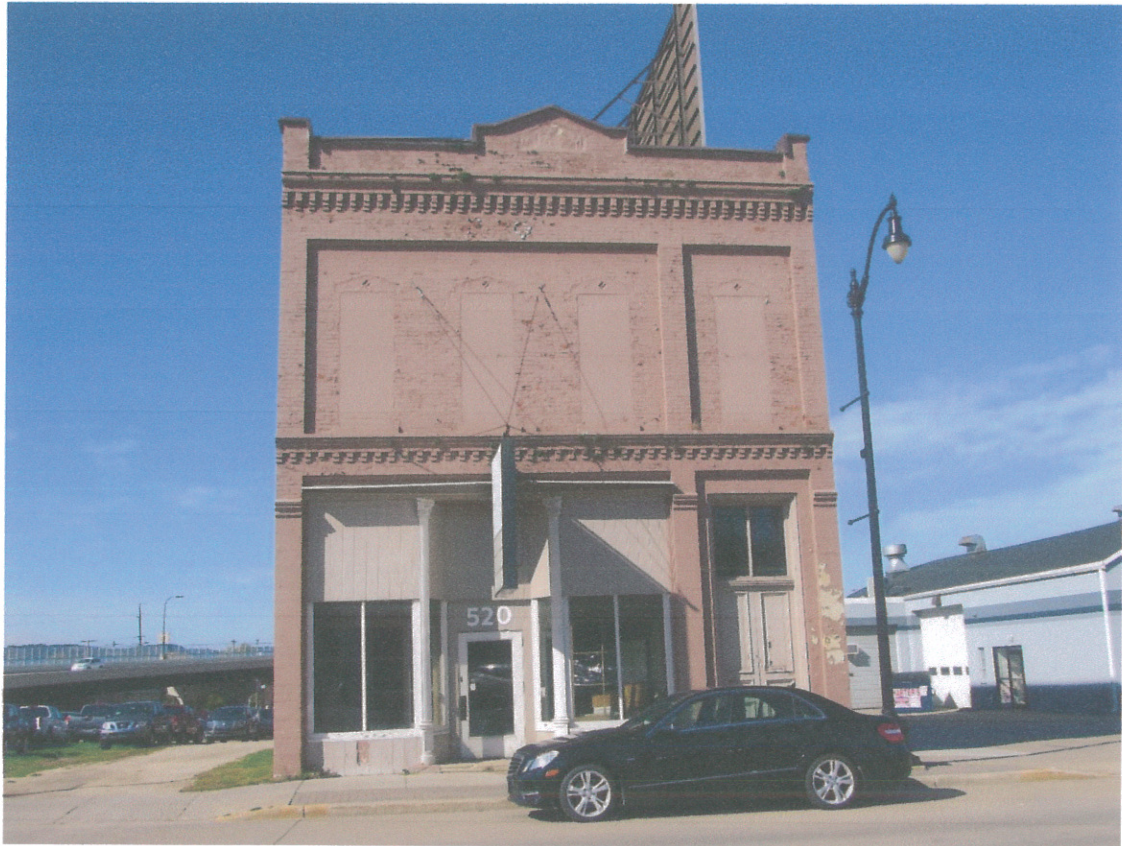
520 Third St. S., east (front) façade, facing west.