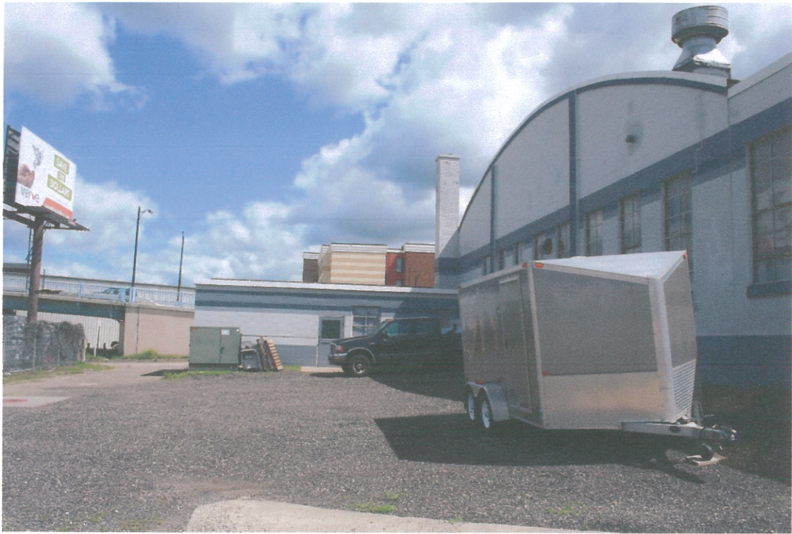
From back of 520 Third St. S., facing north toward rear of adjacent property and abutment of Cass Street Bridge.