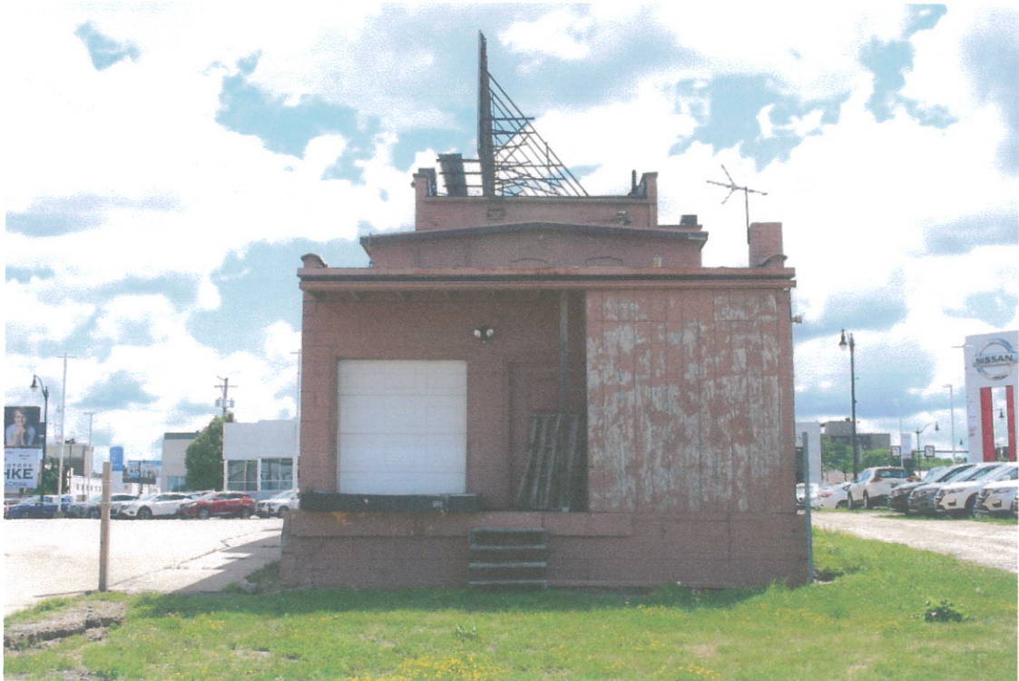
520 Third St. S., west/back façade, facing east.