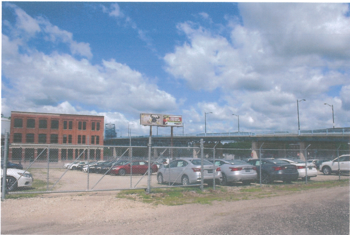
From back of 520 Third St. S., facing west/northwest toward Second St. and Cass Street Bridge