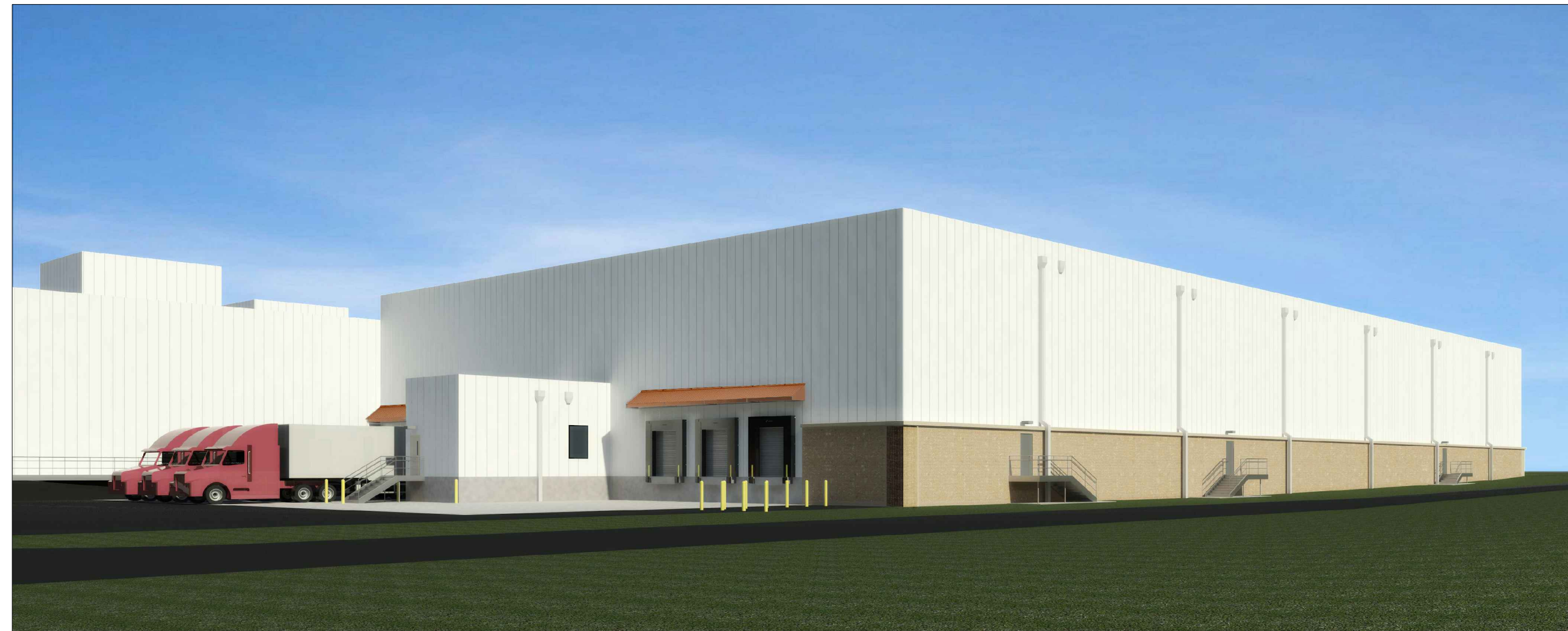
B NORTH EAST PERSPECTIVE VIEW SCALE: NOT TO SCALE