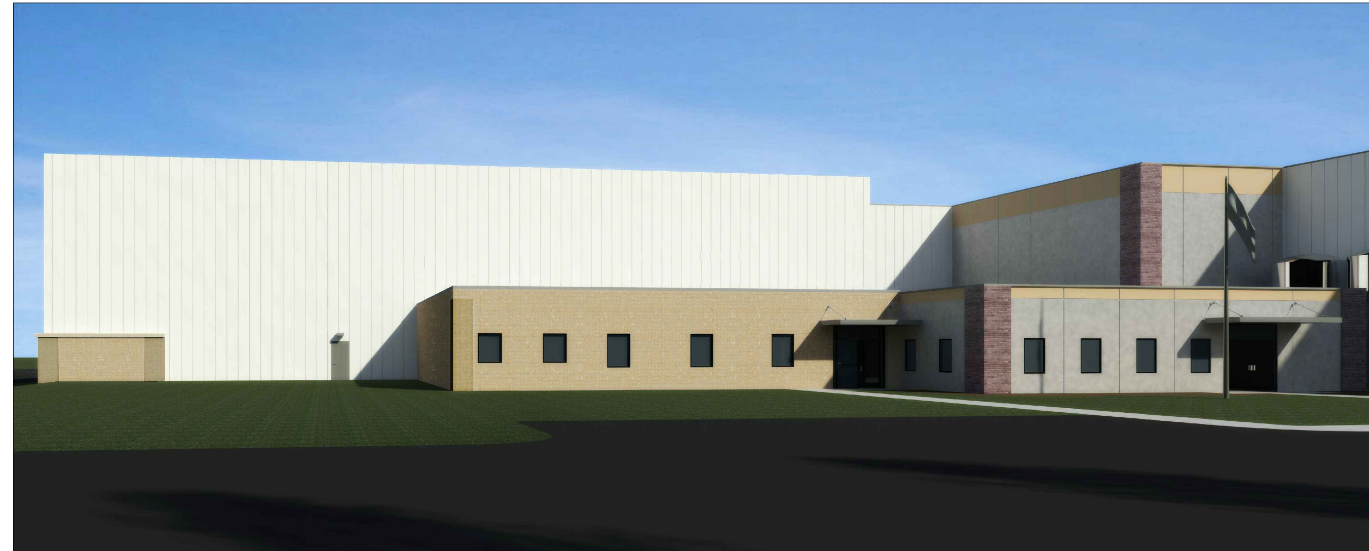
C WEST PERSPECTIVE VIEW SCALE: NOT TO SCALE