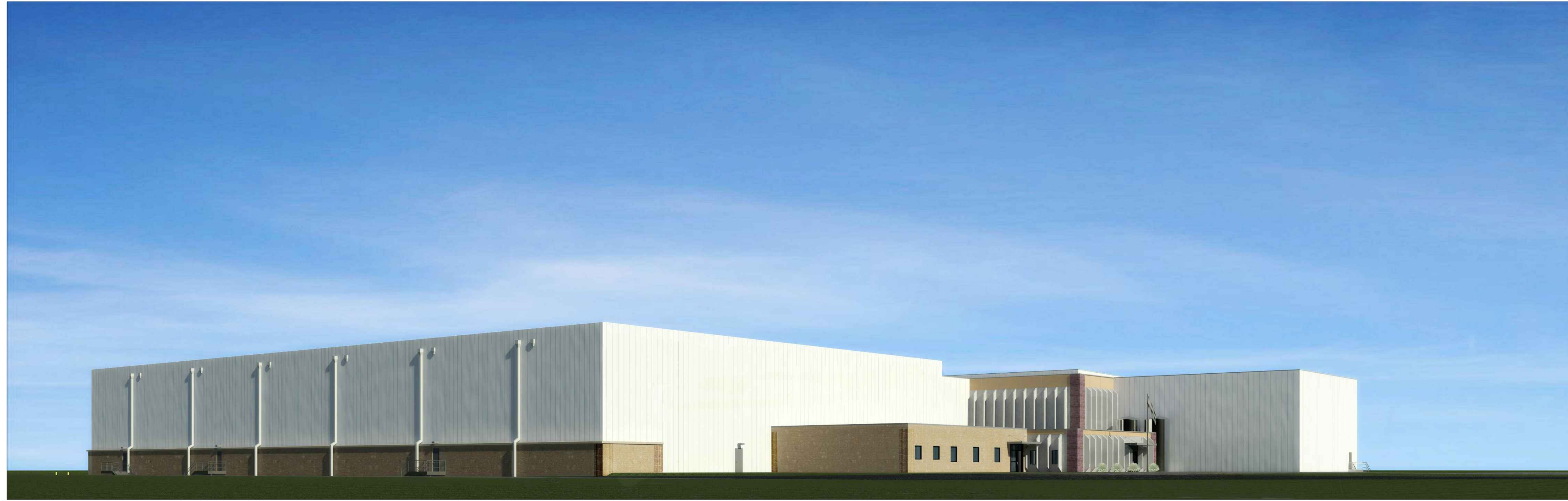
A NORTH WEST PERSPECTIVE VIEW SCALE: NOT TO SCALE