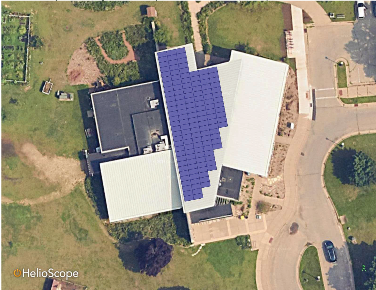
Diagram is an approximation

System Rating: 78.88 kW | Number of Panels: 136 | SolarOffset: 78%