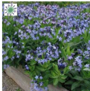
Amsonia 'Blue Ice'