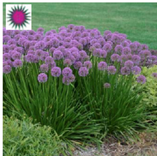
Allium 'Summer Beauty'