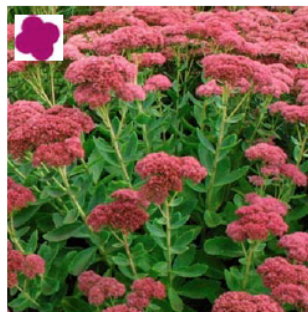
Sedum 'Autumn Fire'