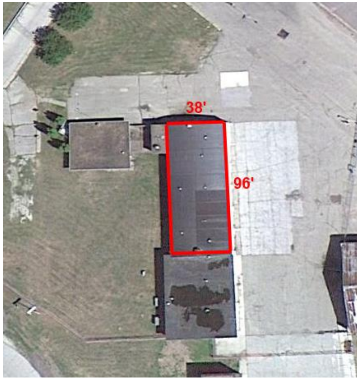
North End of 2842 Fanta Reed Road