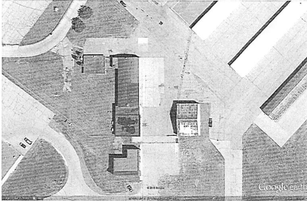
South End of 2842 Fanta Reed Road