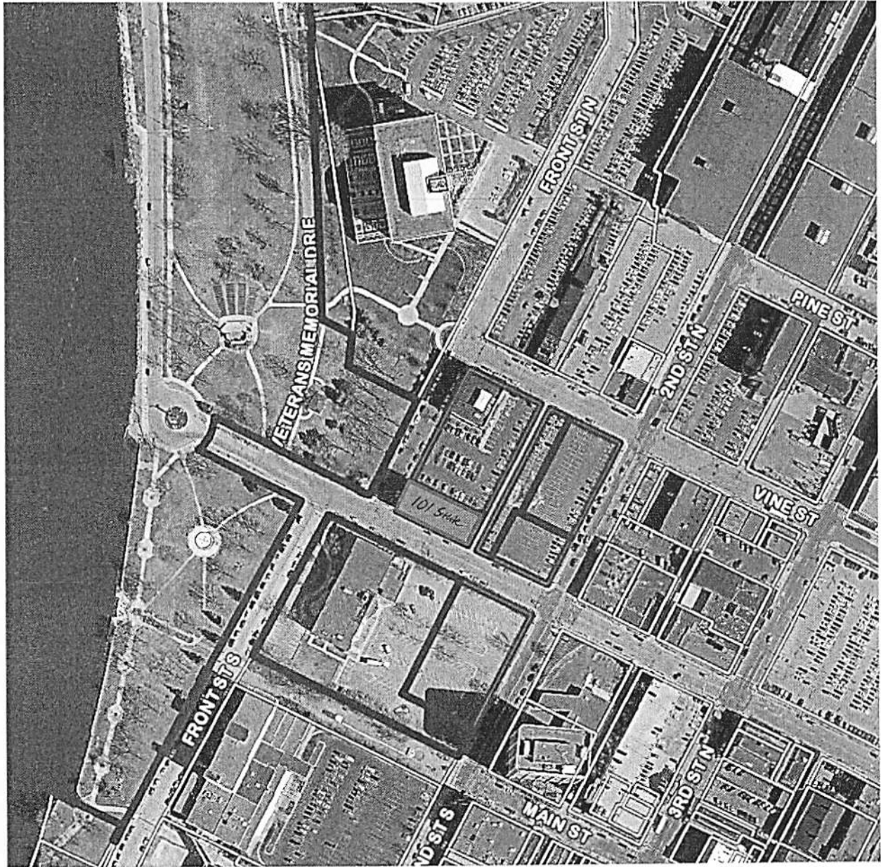
The Charmant Hotel – 101 State St. – Outdoor Cabaret 200' Buffer