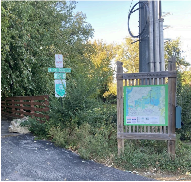
Sample location of a Marsh Trail sign