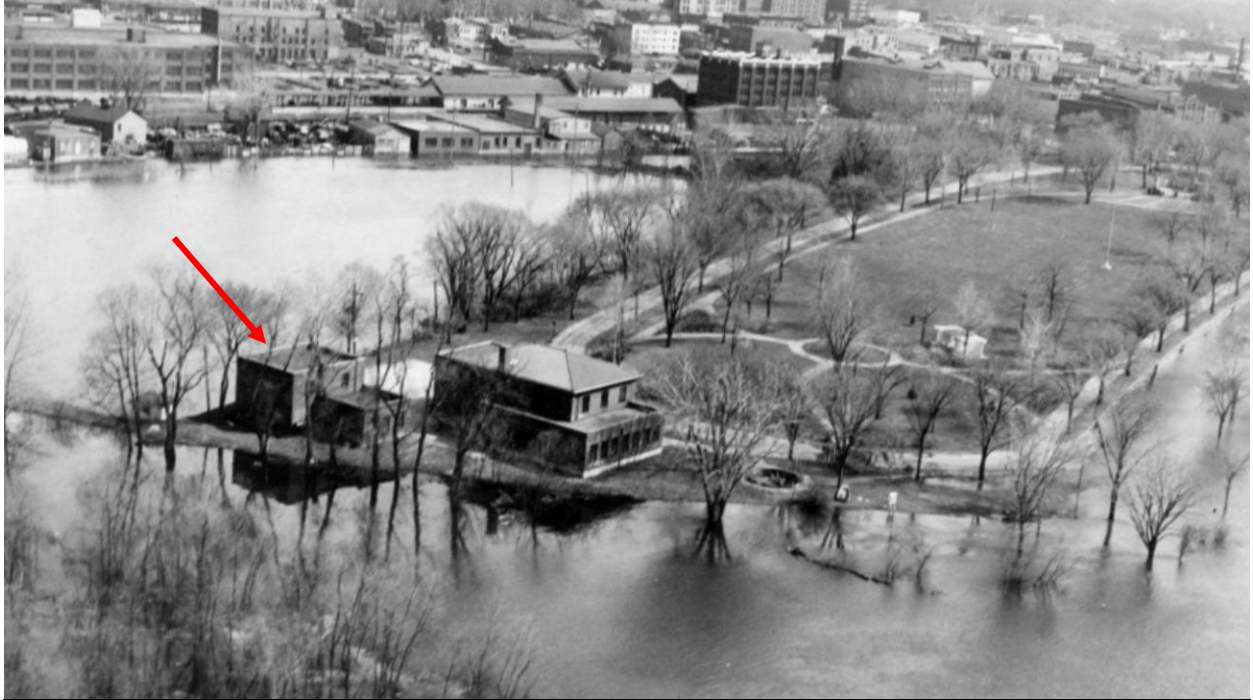
1952 Mississippi River Flood, notice 2 nd floor and west wing additions have been constructed on the garage.