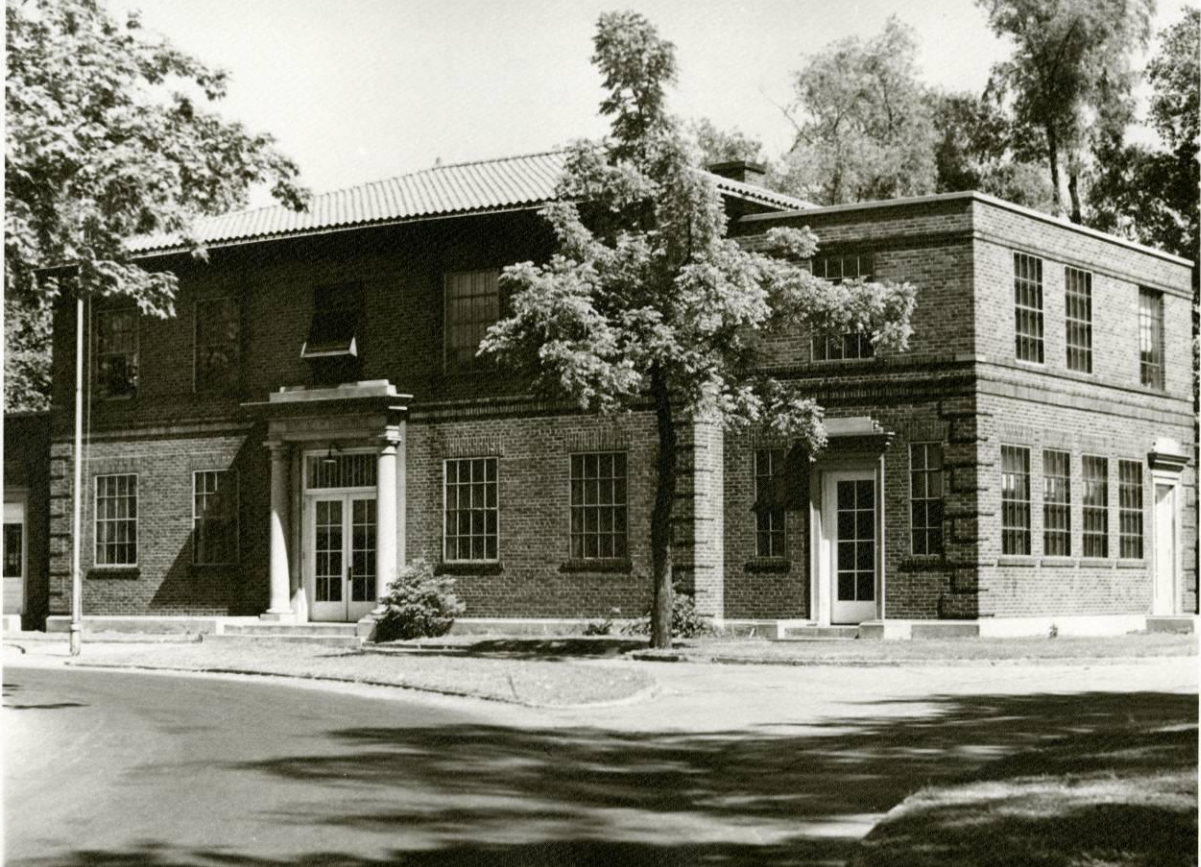
Fish Lab Building ca 1946, notice 2 nd floor addition has been added