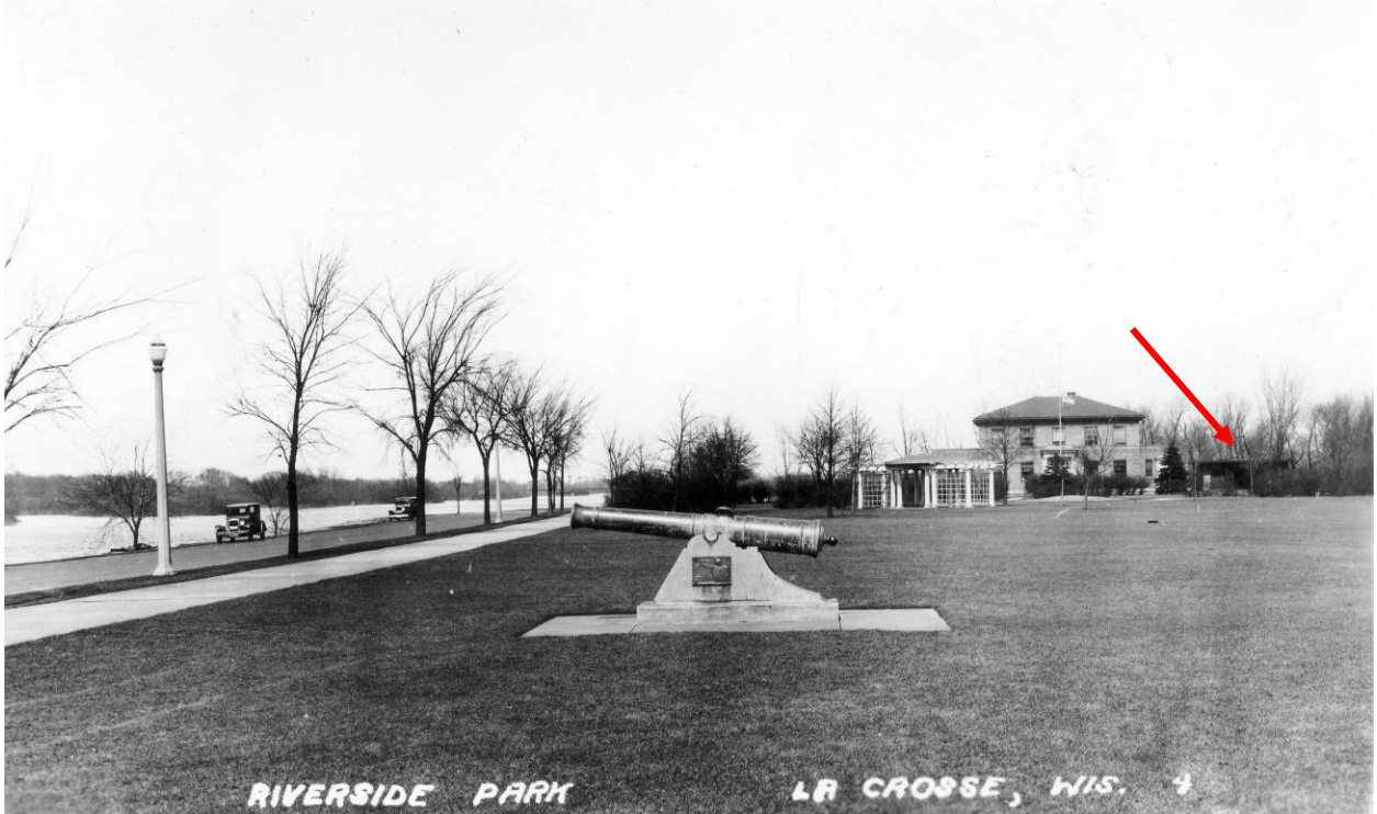
Garage can be seen in the background, notice the 2 nd floor addition of the main building has not yet been constructed.