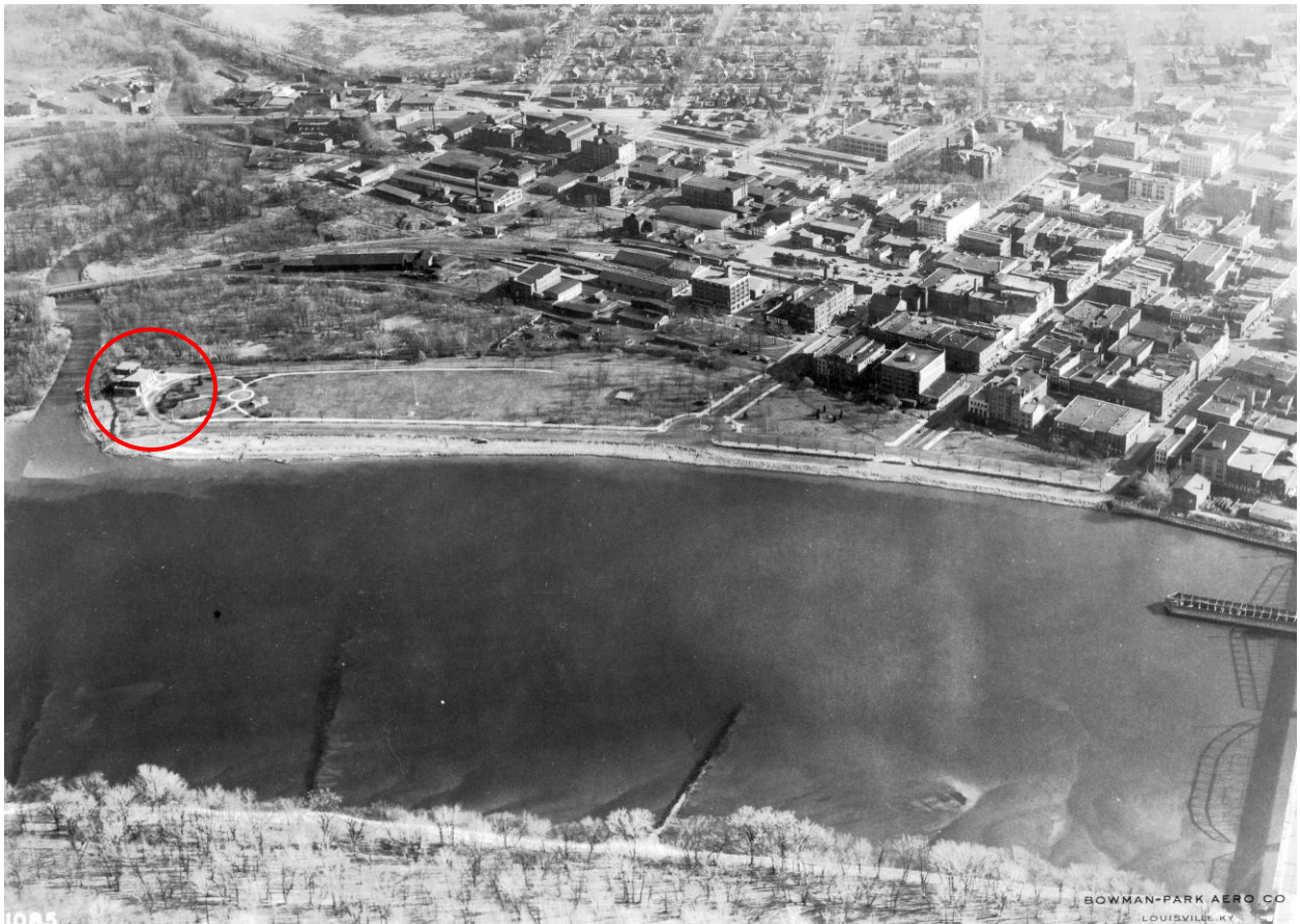
Aerial photo taken ca 1924-1931