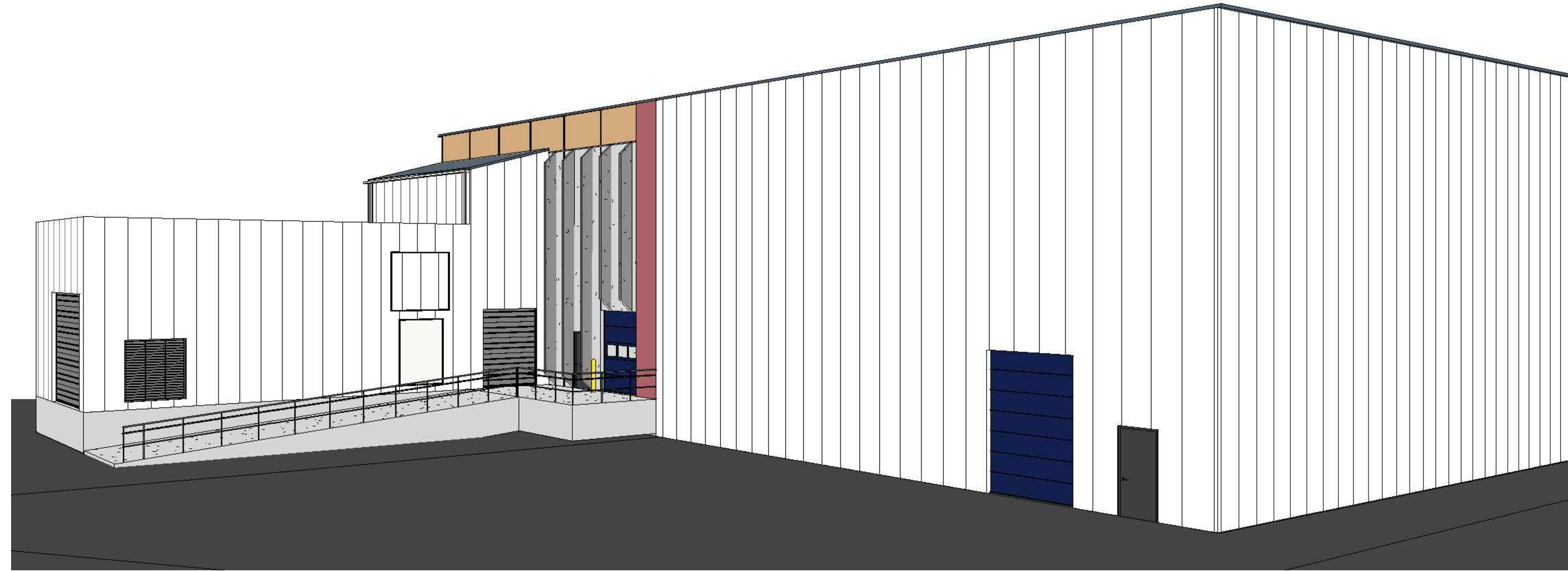
B ENLARGED NORTH PERSPECTIVE VIEW SCALE: NOT TO SCALE