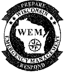
EXHIBIT C Wisconsin Hazardous Materials Response System