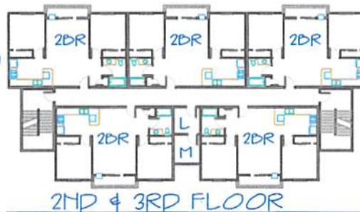
2ND & 3RD FLOOR

REQUIRED DIKE SPACE = 36/3 = 12 SPACES OR 27'X6' AREA