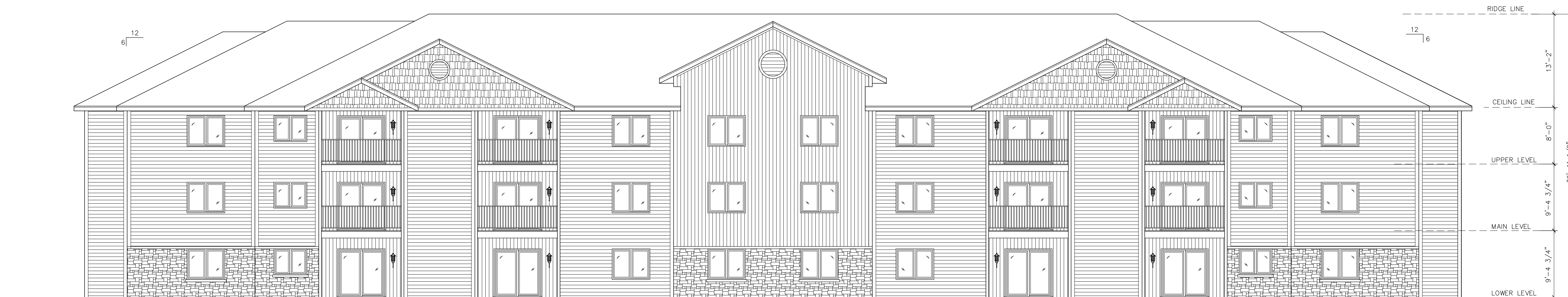
1 NORTHWEST ELEVATION 1/8" = 1'-0"