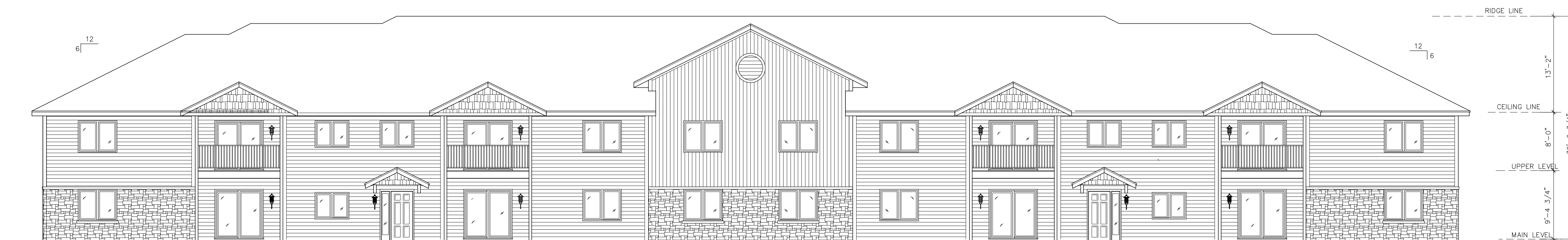
2 SOUTHEAST ELEVATION 1/8" = 1'-0"