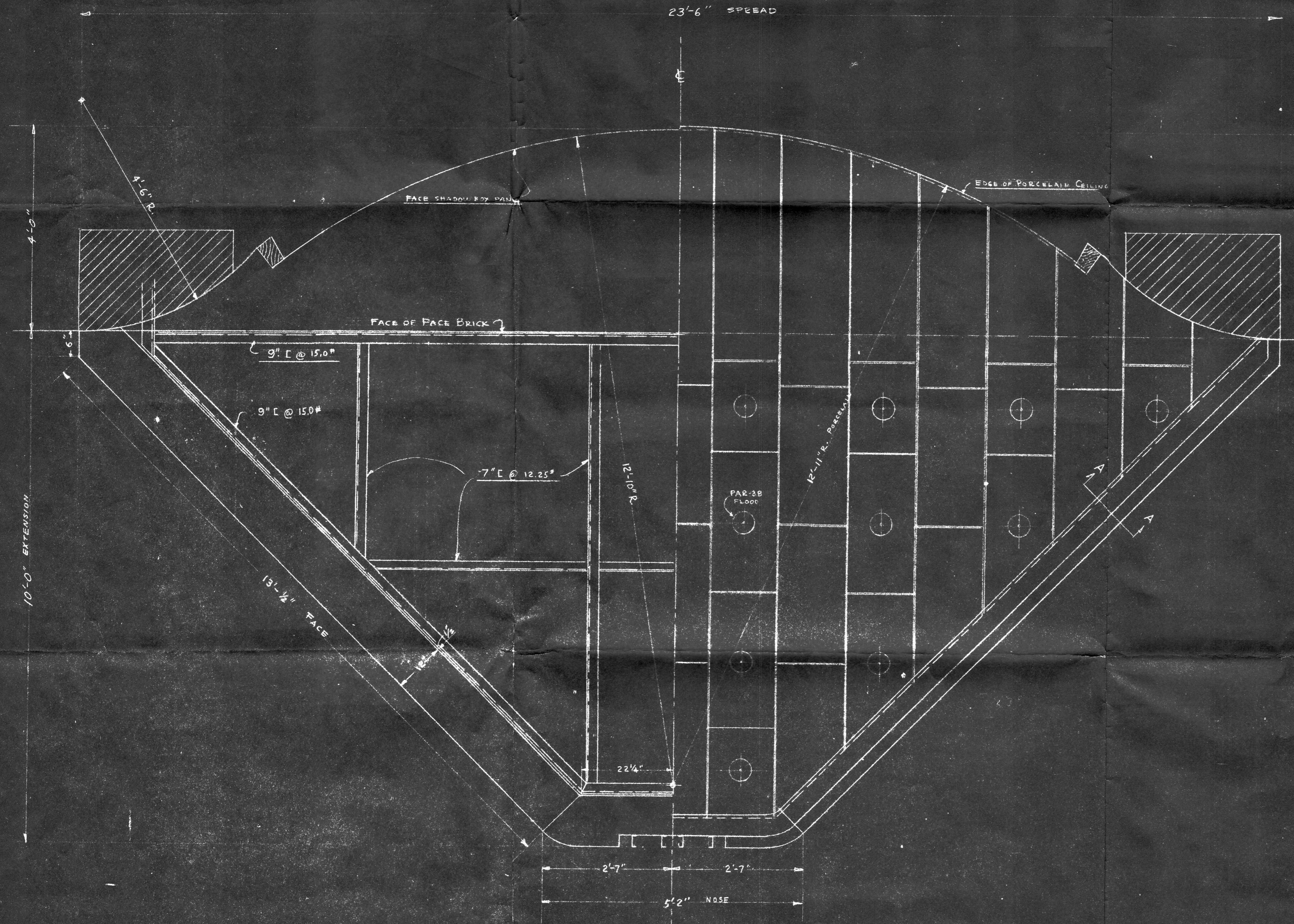
PLAN CANOPY STEEL & REFLECTED CEILING Scale - 3/8" = 1'-0"