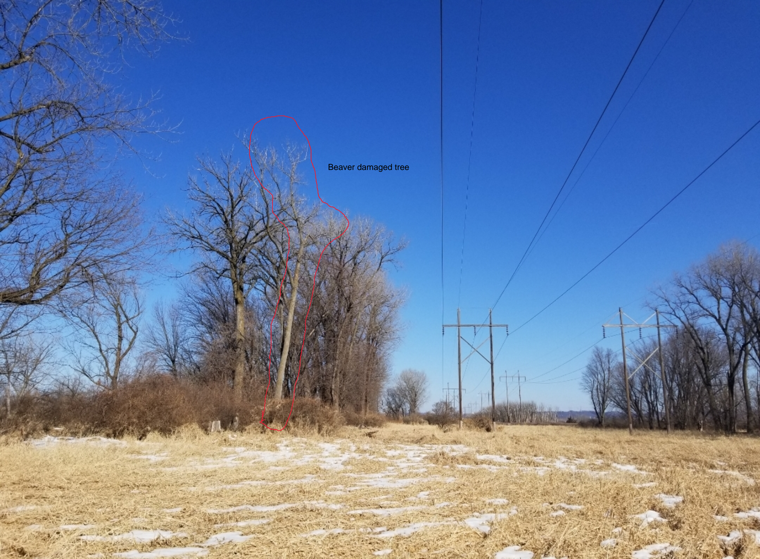
Beaver damaged tree