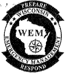
EXHIBIT C Wisconsin Hazardous Materials Response System