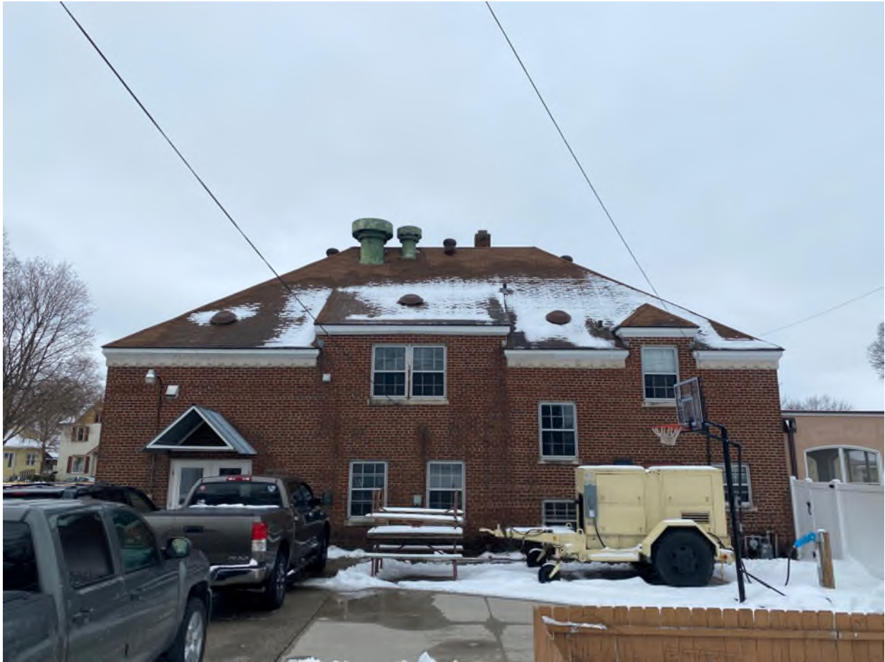
Fire Station No. 4, East Elevation (facing West), 2021.

The East elevation faces the alley in-between Liberty Street and Charles Street, and its view is partially obscured by a modern, white vinyl fence. A parking area on the southeast corner of the building separates the building from the alley. The East elevation emphasizes the full shape of the hipped roof, asymmetrical window placement, and is visually divided into multiple sections or bays.