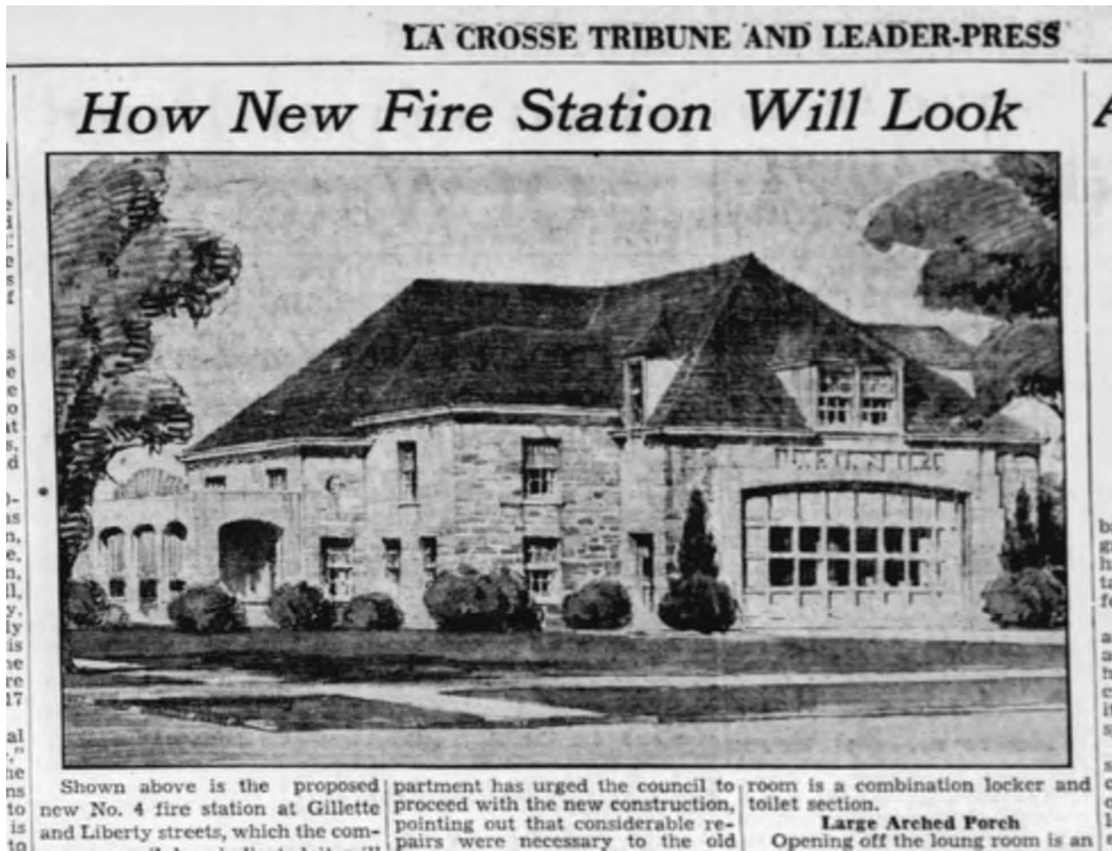
Fire Station No. 4 Architectural Rendering.

The earliest fire stations in the City of La Crosse date back to the late 1860s when teams were largely volunteer-based. Fire stations at that time were primarily designed to contain horse-drawn sleighs or wagons, with stables where horses would feed and sleep. All of the existing fire stations in this period more closely resembled a barn than what we commonly think of today as a fire station. The team that now inhabits Fire Station No. 4 can trace its roots back to 1893, when the volunteer company known as “Rescue Hose Company No. 4” was founded. The original Fire Station No. 4 was constructed in 1892-93, demolished to make way for the current Fire Station No. 4, formerly situated immediately south of the current station on Liberty Street.