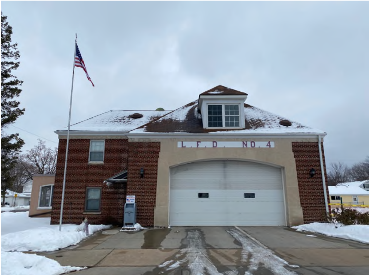
Fire Station No. 4, West Elevation (facing East), 2021.

The West elevation faces Liberty Street, and the roof line is a mirror image of the North elevation. The arched entrance to the apparatus room echoes the arches found on the front porch, with a hipped-roof dormer centered above the arch. The West elevation conspicuously displays the large, segmental arched apparatus entrance, used for fire trucks and other apparatus. It is trimmed in Bedford stone, with each segment of stone reducing slightly in size as it rises vertically, creating a subtle, scalloping effect along the way.