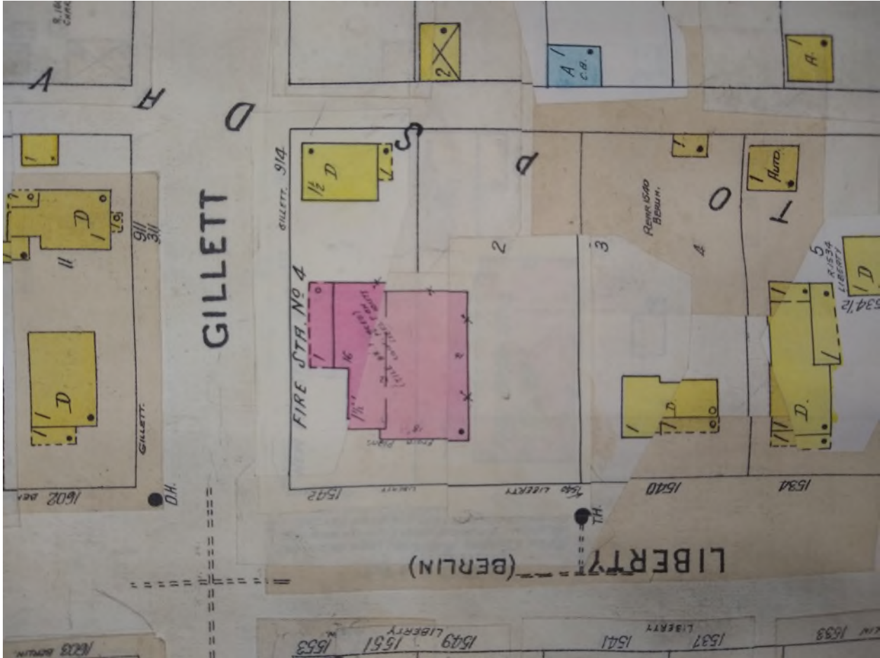
Fire Station No. 4 - Sanborn Fire Insurance Map.

On February 15, 1927, the City of La Crosse purchased the lot on the southeast corner of Gillette and Liberty Streets for a cost of $3500. The proposed cost of the brick building was $26,855.00, which adjusted for inflation would be the 1940 equivalent of $496,454.96.