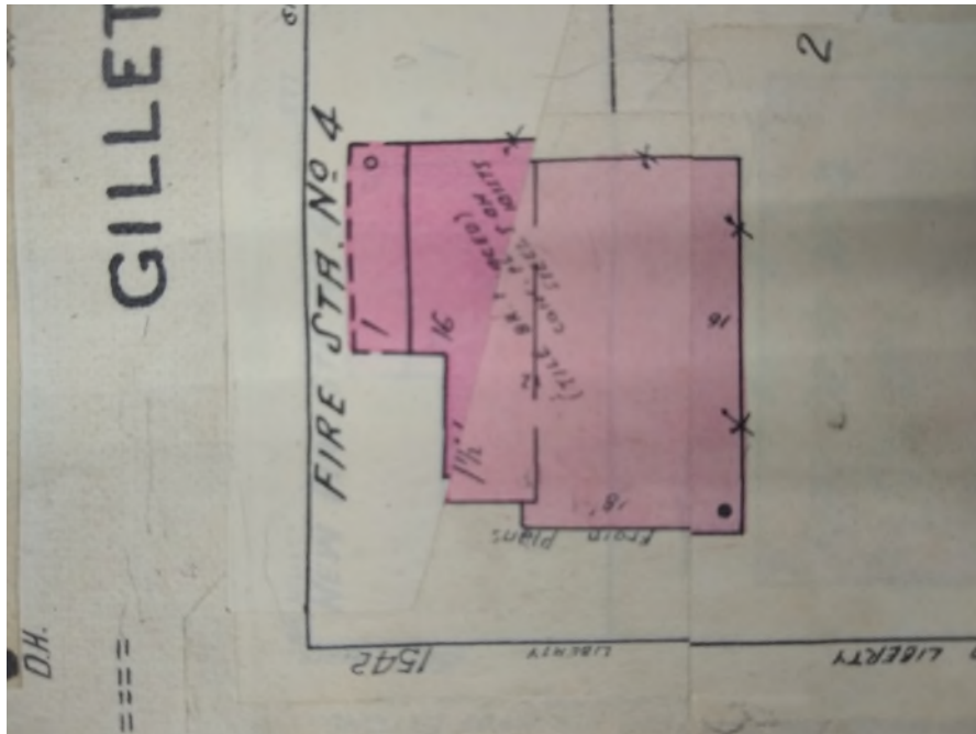
Sanborn Fire Insurance Map ca. 1940-1950 (detail).