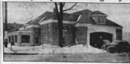
Working on the new No. 4 fire station, shown above, which will soon be dedicated to the city.

The new fire station, which was built at a cost of $25,000, was dedicated last night.