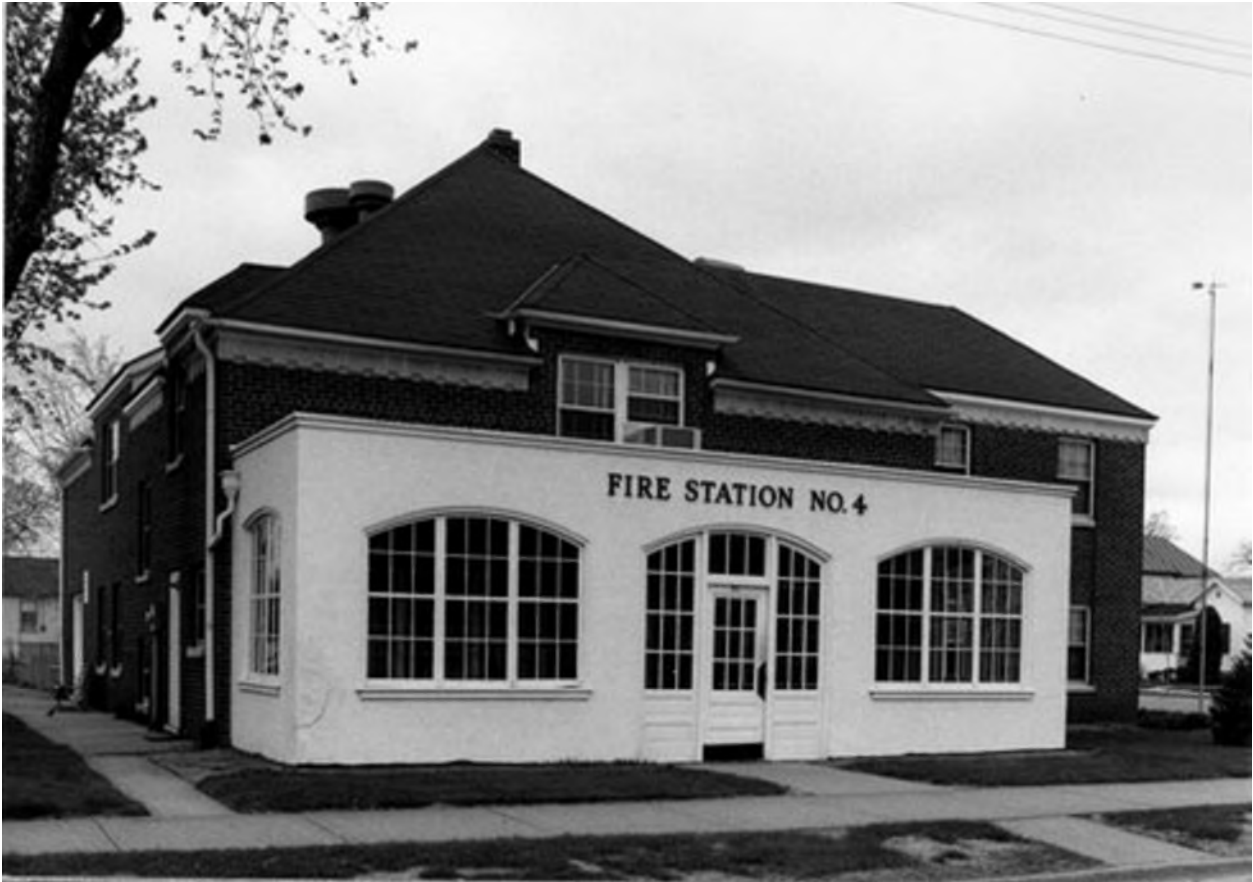
Fire Station No. 4, North façade, (facing Southwest), ca. 1996.

Fire Station No. 4 is located at 906 Gillette Street, the Southeast corner of Gillette and Liberty Streets, on the historic North Side of La Crosse. Built in 1940, it's the oldest operating fire station in the City of La Crosse. Fire Station No. 4 is a two-story building, 61 feet long, 54 feet wide, constructed of load-bearing brick walls with Bedford stone trim.