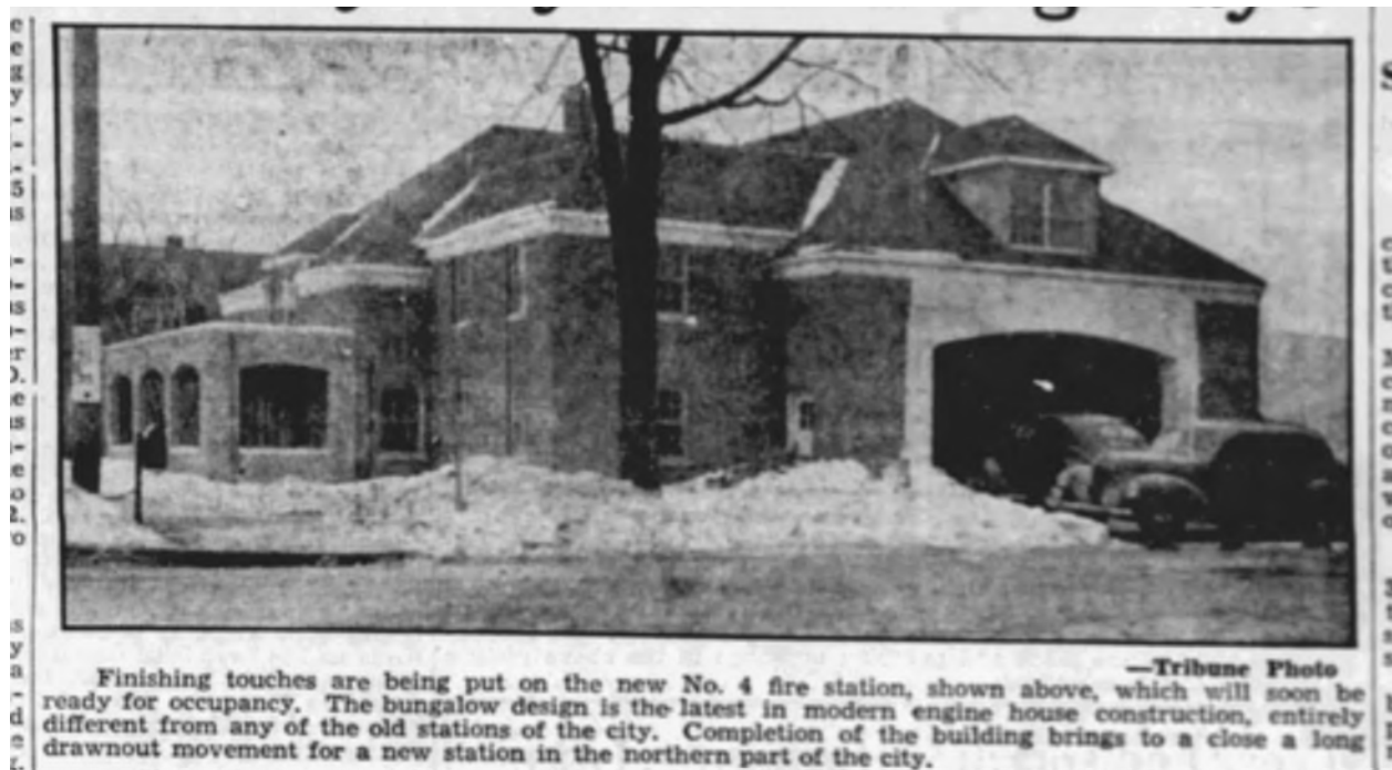
Fire Station No. 4.

Fire Station No. 4 is historically significant because Wisconsin architect J. Mandor Matson designed a Tudor-style fire station in an effort to blend into a residential neighborhood, and it's unlike all existing fire stations made at that time. It's Tudor-style design features roof dormers, double-hung windows, and an arched porch "adding an attractive touch of style" according to the August 18, 1940 La Crosse Tribune and Leader-Press article.