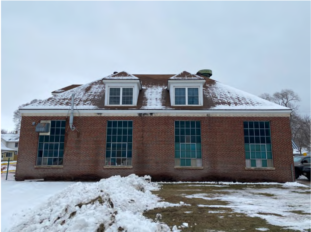
Fire Station No. 4, South Elevation (facing North), 2021.

The South elevation is entirely symmetrical, representing a complete departure from the asymmetrical layout of the other three elevations. The hipped-roof is prominent, and a pair of hipped-roof dormers are symmetrically placed on the roof.