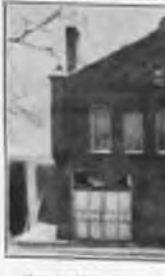
Shown is pictured the old No. 4 fire station, which was demolished last night.

After many years of agitation the old No. 4 fire station, which has been replaced by the new building, was demolished last night.