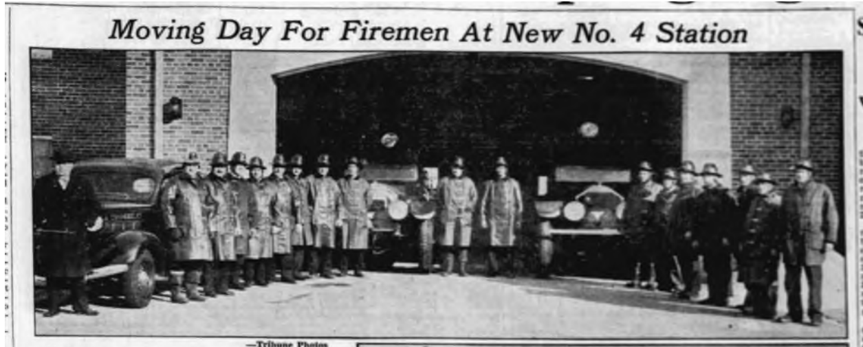
Fire Station No. 4.

historic integrity is intact, and as such is a significant part of La Crosse history as well as firefighting history, and deserves to be a La Crosse Local Historic Landmark.