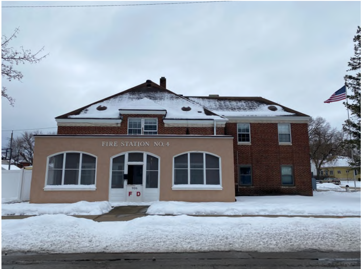
Fire Station No. 4, North Elevation (facing South), 2021.

The North elevation prominently displays a one-story, flat roofed porch clad in stucco with three arched openings. The porch is 33 feet wide, 9-1/2 feet deep, and placed off-center from the main structure, extending toward Gillette Street. The central arch of the porch contains the pedestrian entrance door, segmented by a transom and multi-light sidelights. The central arch is flanked on either side by matching, multi-light arched windows.