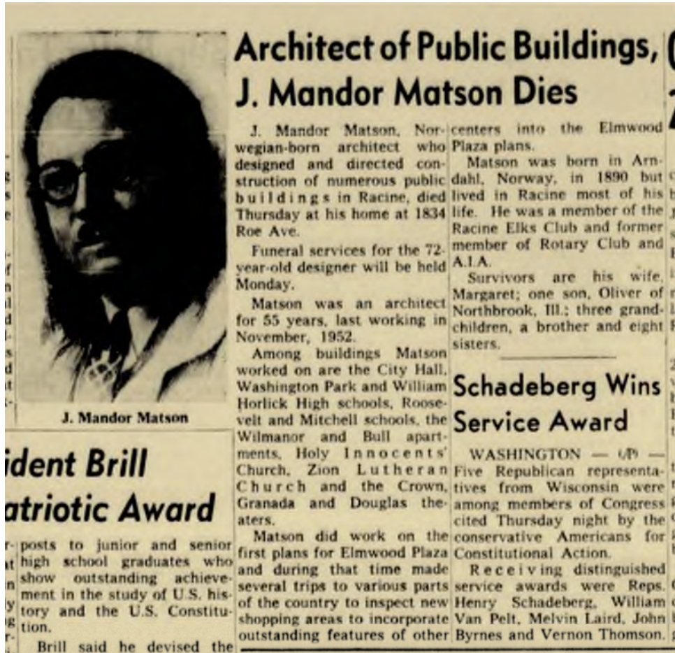
The Journal Times (Racine, Wisconsin) 24 May 1963, Fri, Page 5.