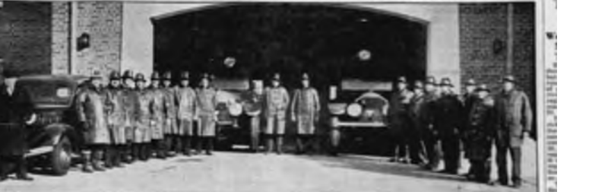
Moving into the new No. 4 fire station this week from the old station with their equipment, including the new fire engine, is the new fire crew.

The new fire station, which was built at a cost of $25,000, was dedicated last night.