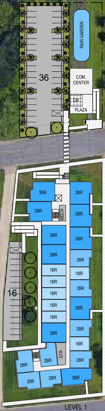
1 Option 1B SCALE: 1" = 80'-0"