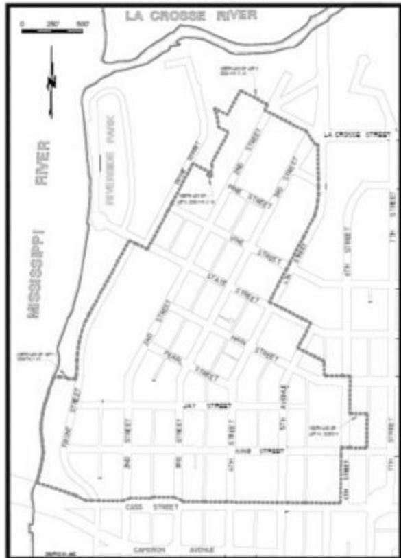
EXHIBIT A PARKING DISTRICT BOUNDARY REVISED 4/12/2019

Dated this 3rd day of July 2025. BOARD OF PUBLIC WORKS