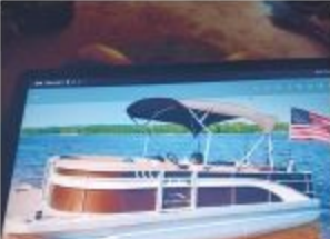
2017 Bennington pontoon Karavan trailer included Text 608 769 0242