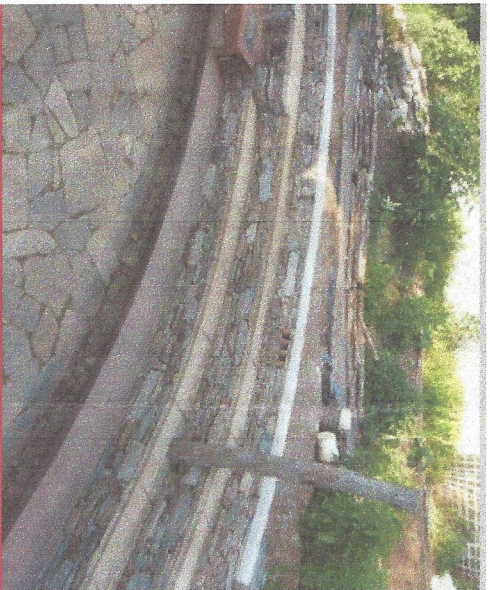
PROPOSED STONE AMPHITHEATER AT MARSH EDGE

The La Crosse River Marsh is thought to be one of the finest urban wetlands in Wisconsin.