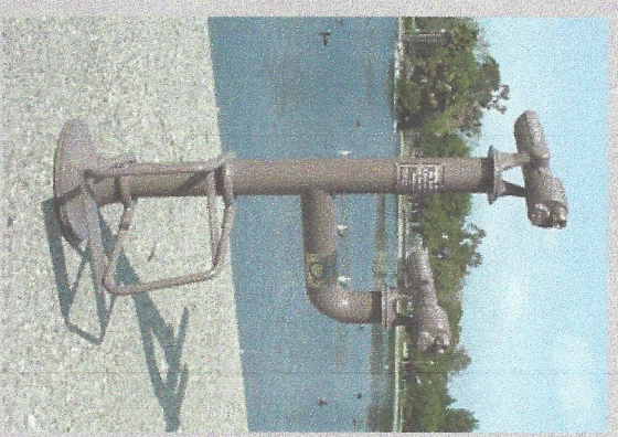
OBSERVATION TELESCOPE AT PLATFORM EDGE