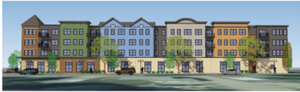
10TH STREET ELEVATION