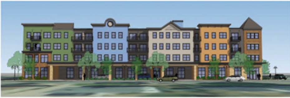
MAIN STREET ELEVATION