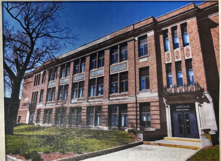
Ca. 2023.

Similar to the former Roosevelt School, these buildings could be converted into apartment and provide much needed housing.