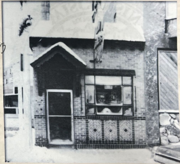
Ca. 1977.