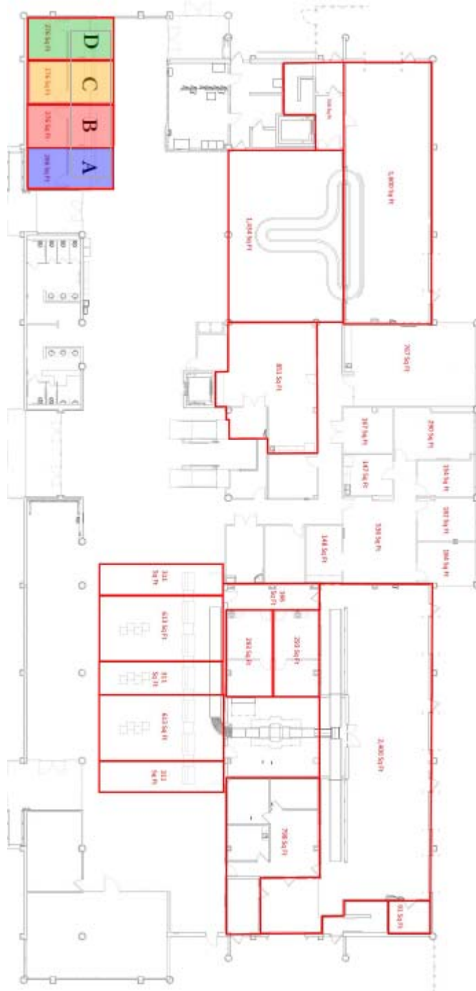
EXHIBIT A1 - COUNTER/OFFICE/QUEUING AREAS