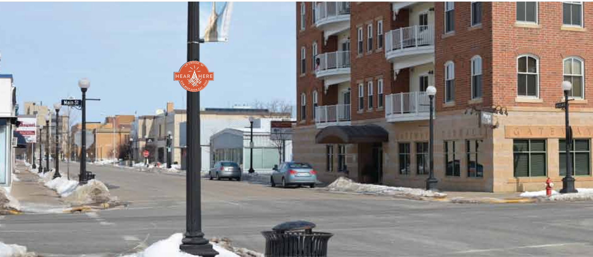
Corner of Main st. and 6 th St. North