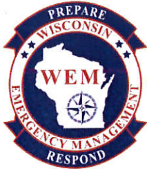
EXHIBIT C Wisconsin Hazardous Materials Response System