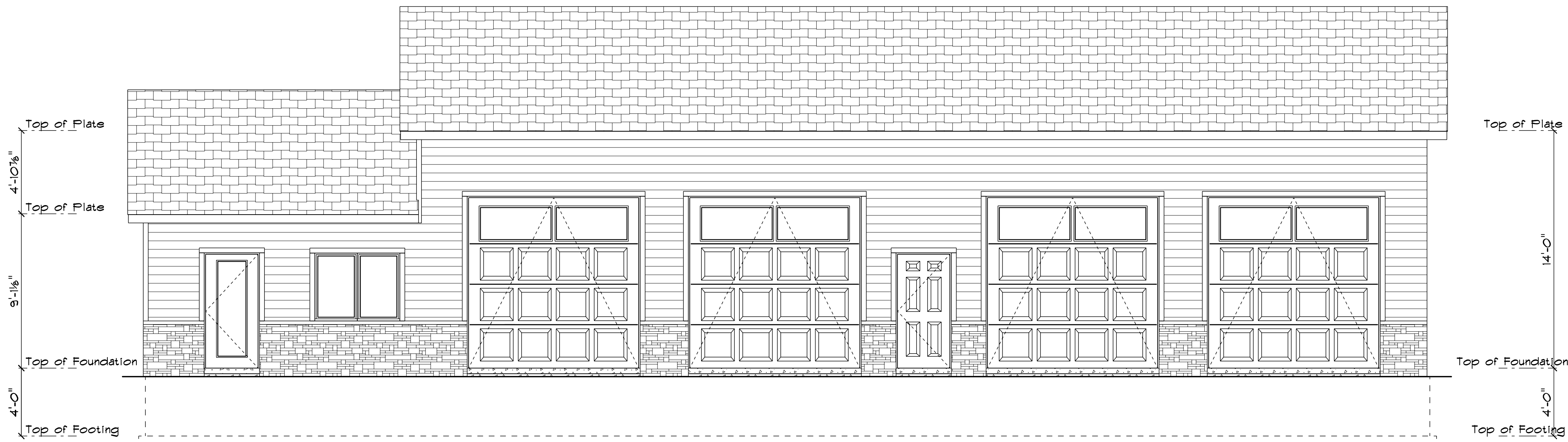
1 1 SOUTH ELEVATION A2