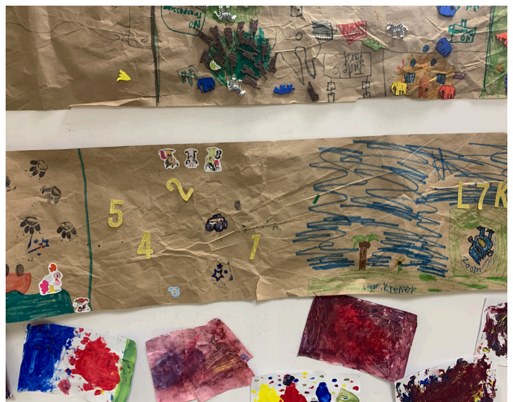
WisCorps, Inc., The Gallery at The Nature Place