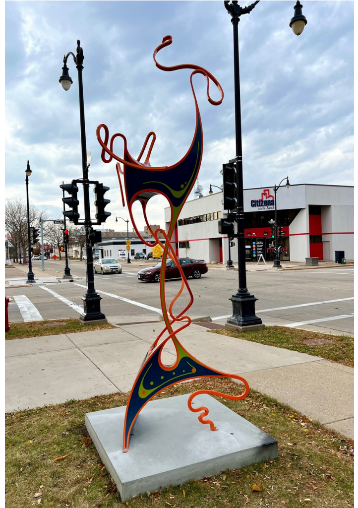
Luke Achterberg, Sculpture in Public Places