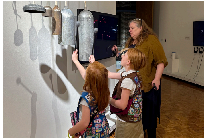
Uwl Visual & Performing Arts, Music &...