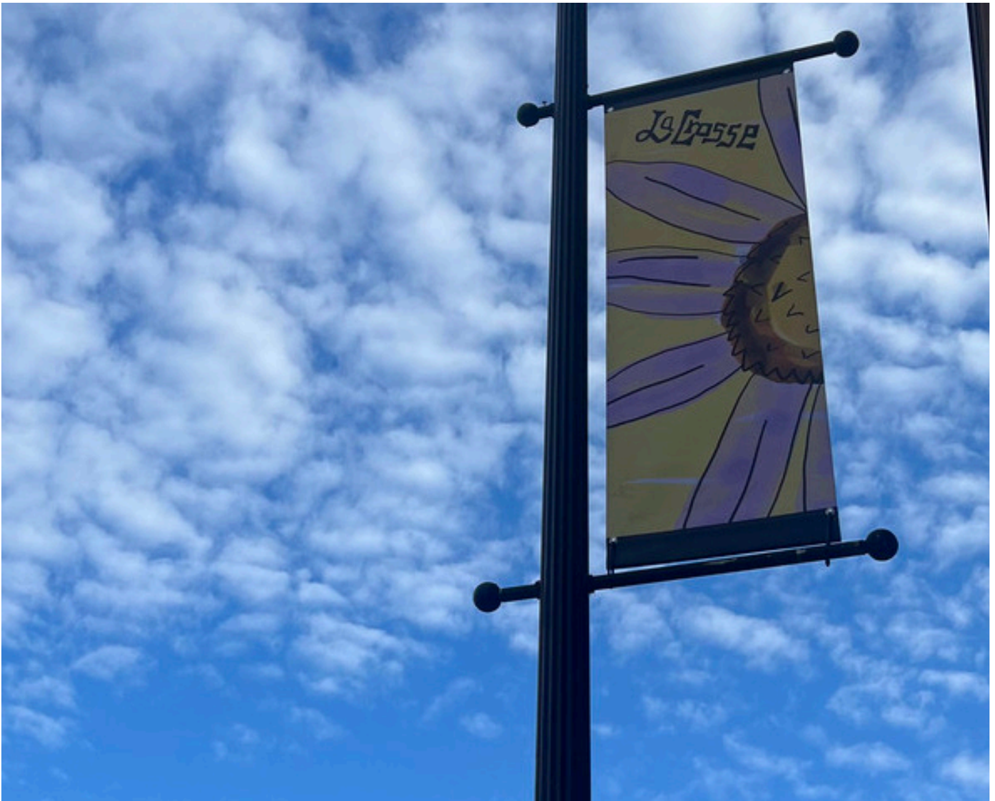
Downtown Mainstreet Inc., Downtown Banner Project