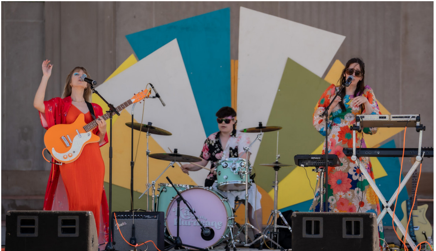
Pump House Regional Arts Center, Artspire La Crosse

Artspire La Crosse is the largest annual arts celebration in downtown La Crosse, produced by the Pump House Regional Arts Center. In 2024, the event moved to Riverside Park, where it received overwhelmingly positive feedback from artists, vendors, and attendees alike. Artspire featured family-friendly performances, music, interactive art experiences, and a well-organized event structure that made it a highlight for community members. The event was praised for its diverse offerings and welcoming environment, bringing together artists and art lovers from all walks of life. As part of the festival, winners of the Inspired by La Crosse public art competition were announced, showcasing local talent in a variety of mediums. The winning works are now on display at La Crosse City Hall. This project received praise for the way the move to Riverside Park allowed for better organization, more space, and greater engagement with attendees. Vendors noted that the park provided room for more interactive art opportunities, creating a family-friendly environment where art, music, and community blended seamlessly. Testimonials from artists and attendees emphasized the positive energy and the sense of community that Artspire fostered. This event continues to serve as a beacon of the thriving arts scene in La Crosse, and its success supported the Arts Board’s mission of creating inclusive and engaging cultural experiences.