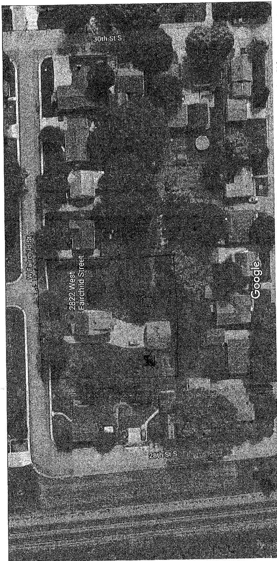
50 ft

Coop dimensions - 9.5' w x 5'7" d x 7'4" h I will ensure coop > 25ft from any adjoining residences