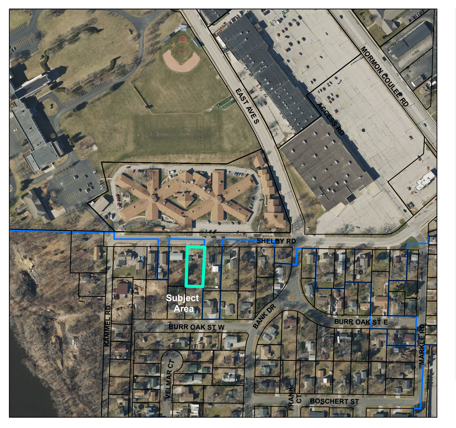
City of La Crosse Planning Department - 2022