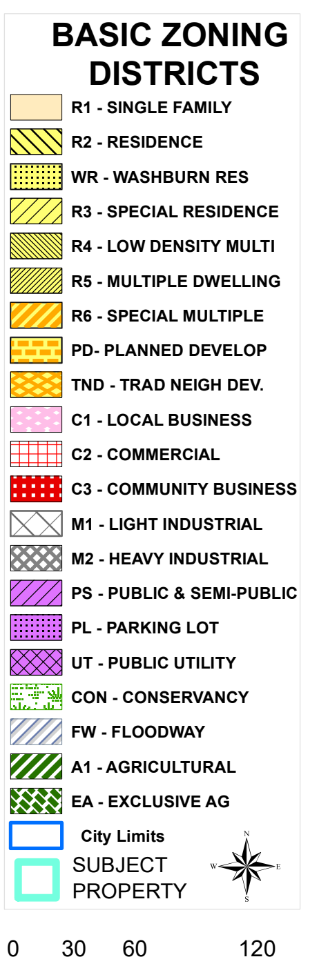
City of La Crosse Planning Department - 2022