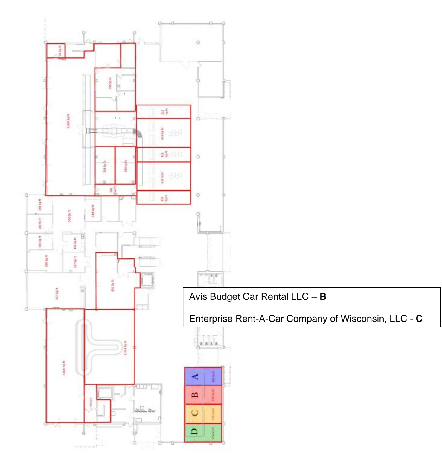
EXHIBIT A1 - COUNTER/OFFICE/QUEUING AREAS