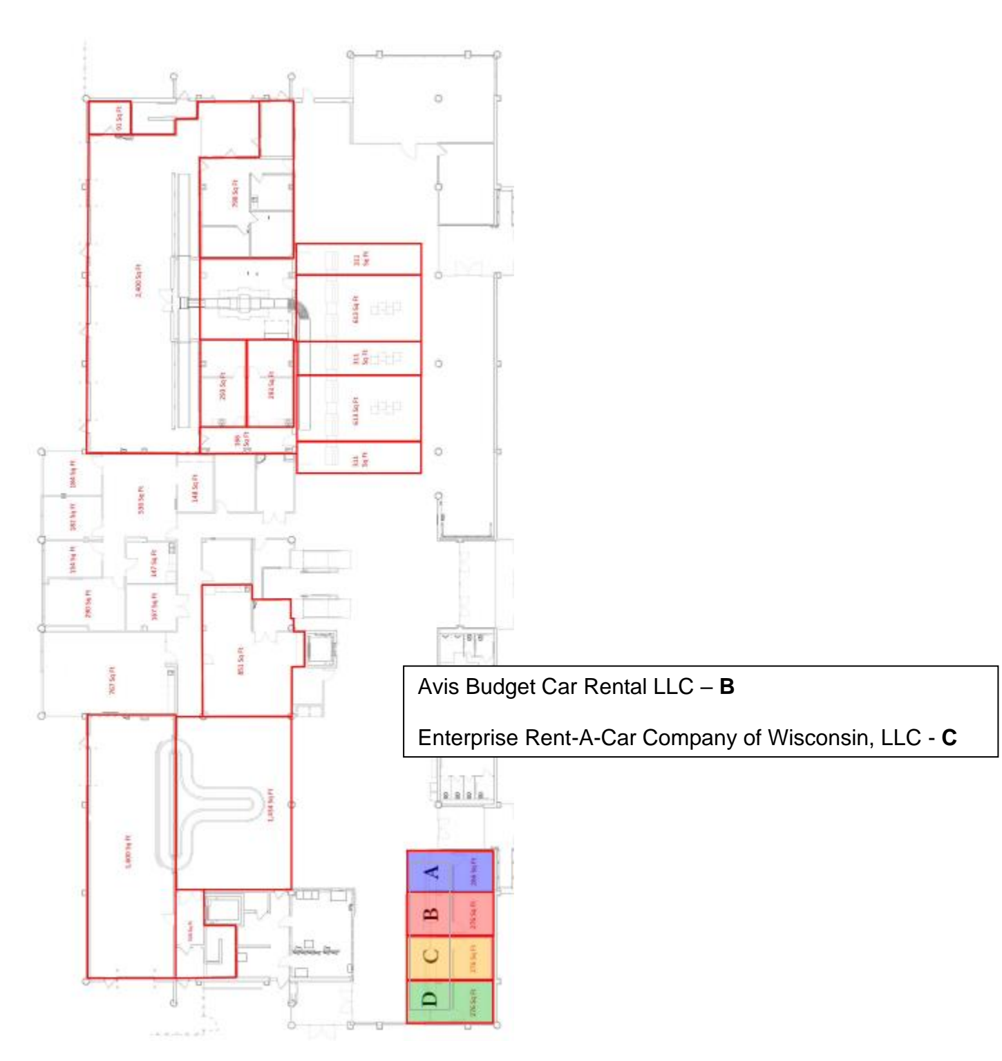
EXHIBIT A1 - COUNTER/OFFICE/QUEUING AREAS