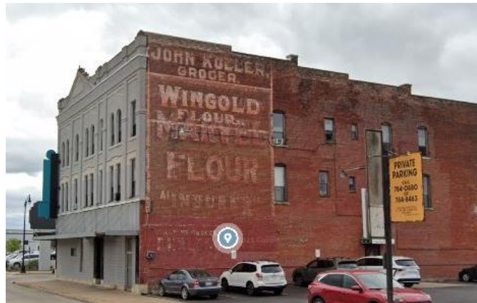
Amanda's Academy of Dance (329 Division Street)