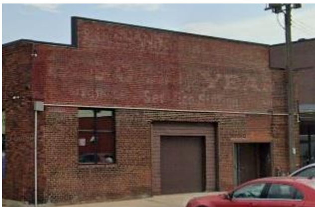
605 State Street