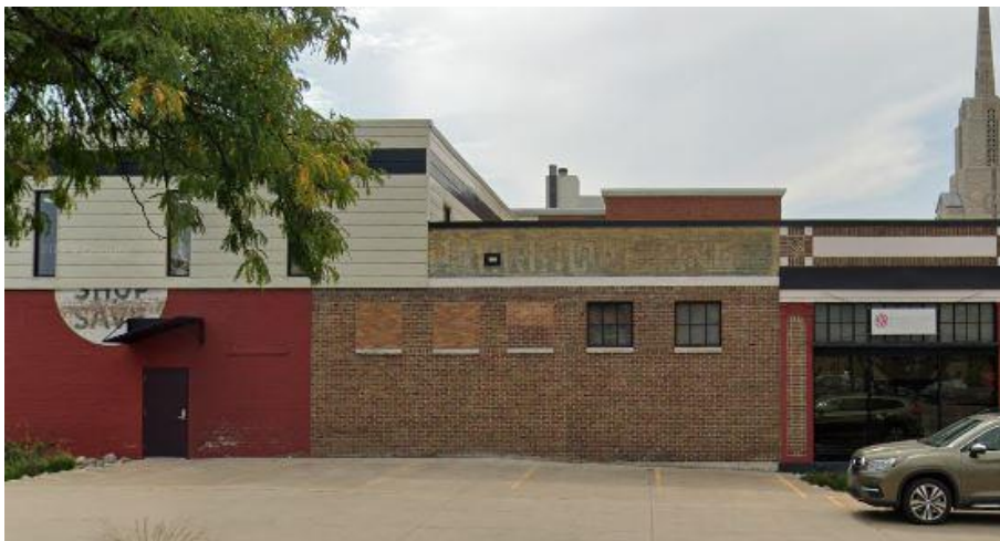
602 State Street