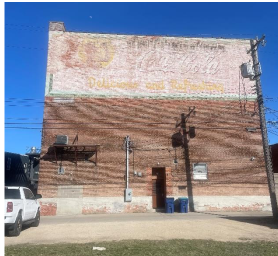
1213 Caledonia Street