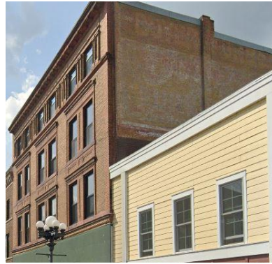
511 Main street