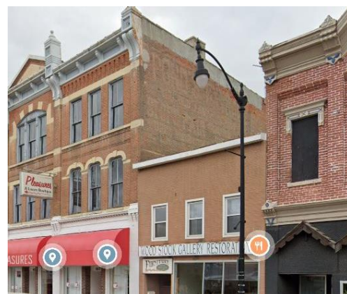
413 3 rd Street