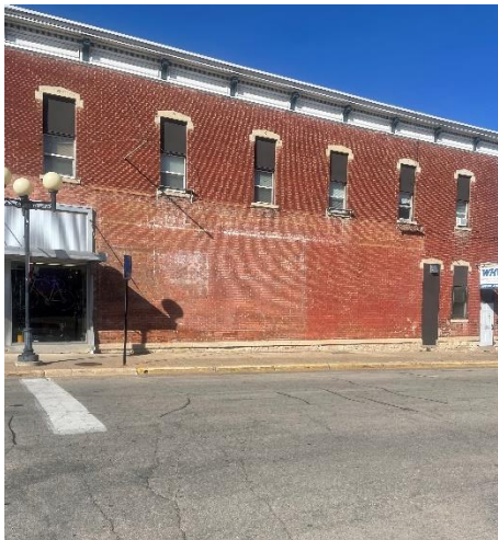
1200 Caledonia Street