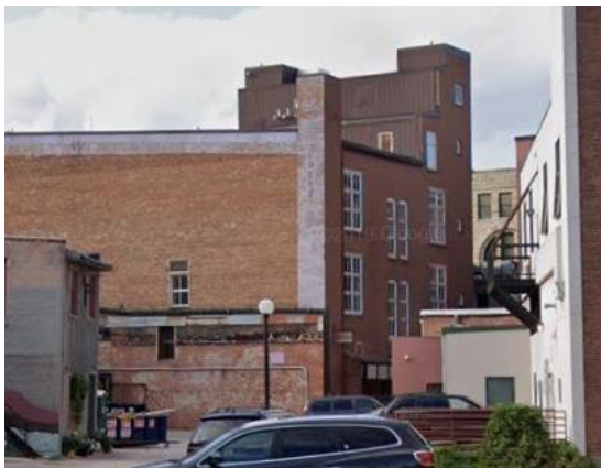
Doerflinger Building (Alley) (400 Main Street)