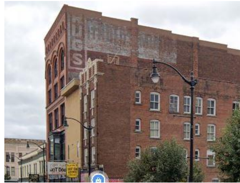
Leithold Music Building (North wall) (116 4 th Street S)