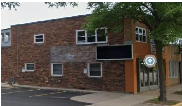
111 7 th Street