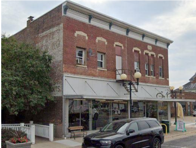
1200 Caledonia Street