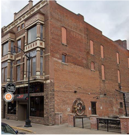
115 3 rd Street