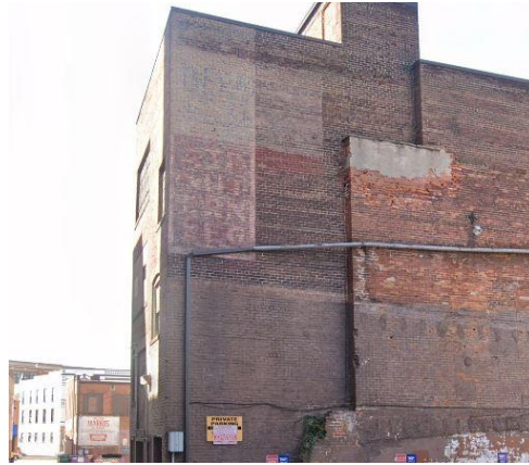
107 3 rd Street