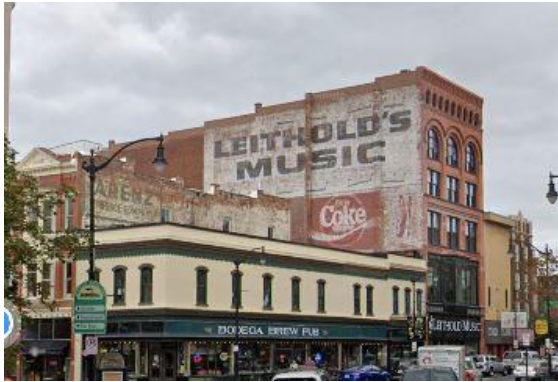
Leithold Music Building & Jules Buildings (116 4 th Street S & 327 Pearl Street)