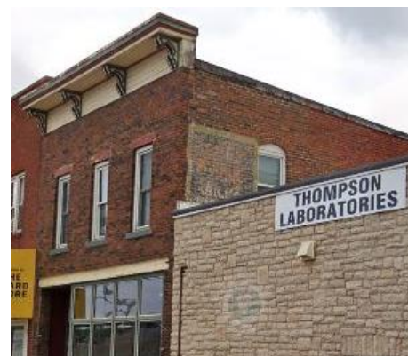
510 Island Street