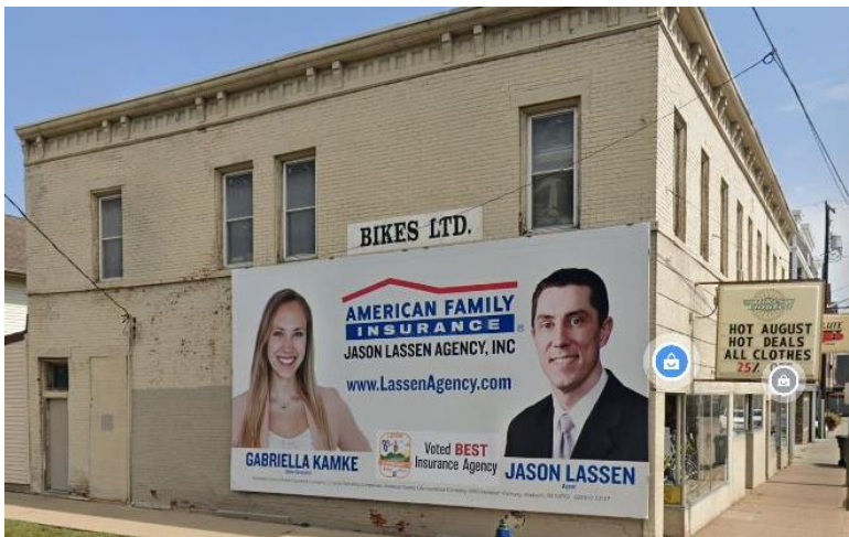
600 10 th Street