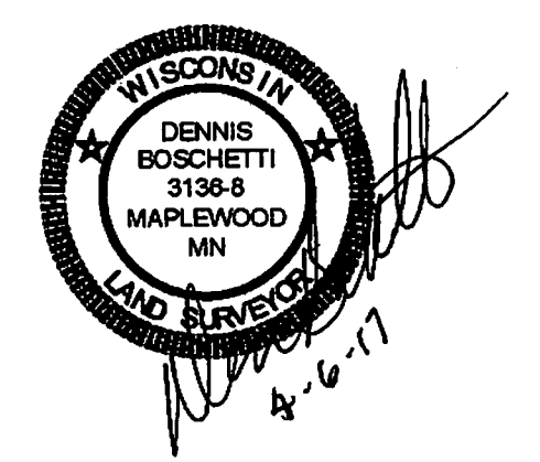
Dénnis Boschetti, P.L.S. Expires 1/31/2018

Containing 3607 square feet more or less.