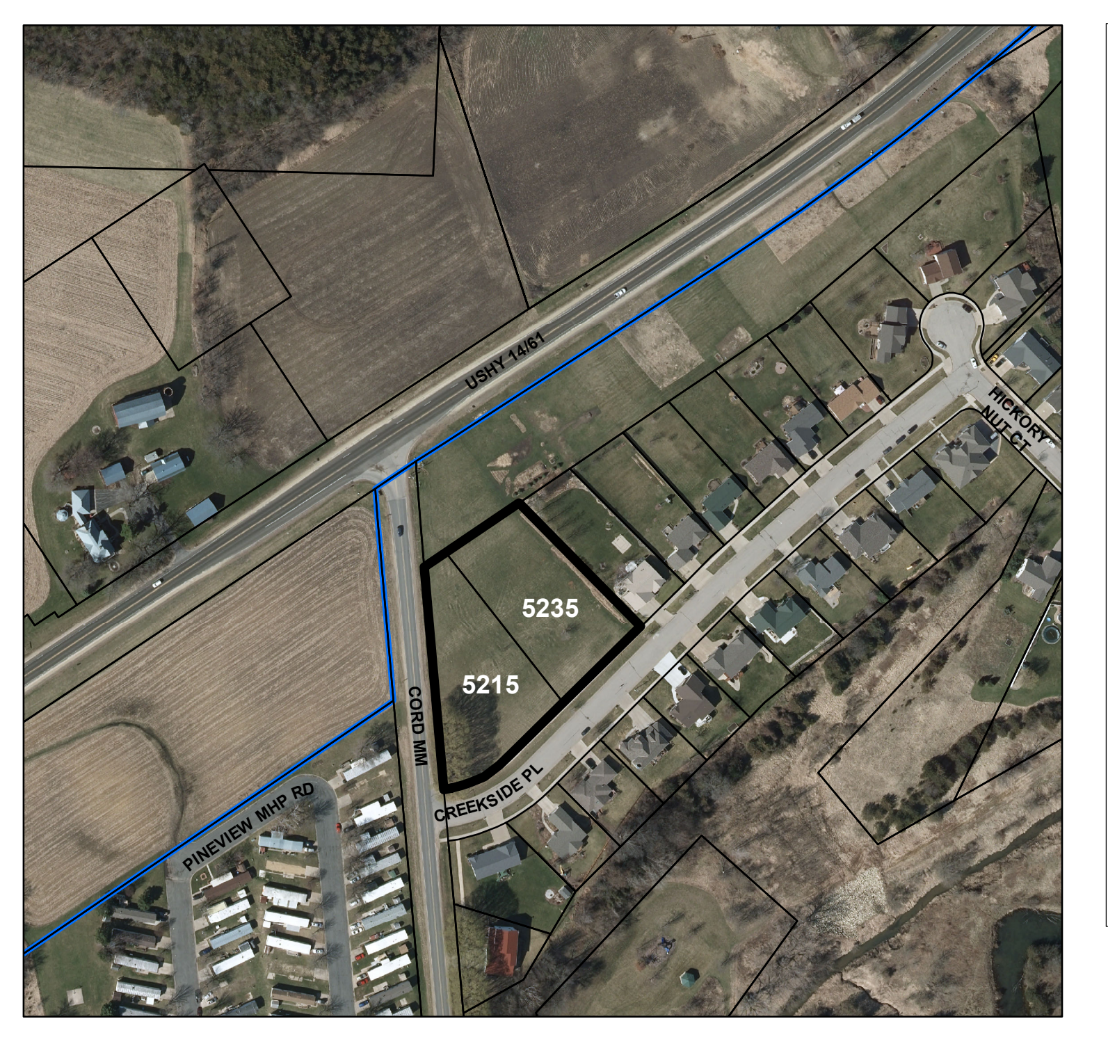
City of La Crosse Planning Department - 2019