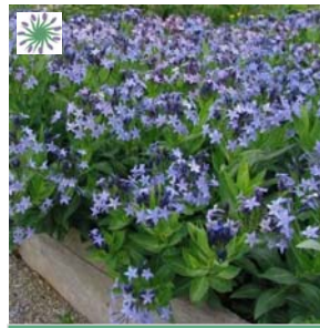
Amsonia 'Blue Ice'