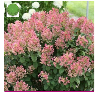
Hydrangea 'Little Quickfire'