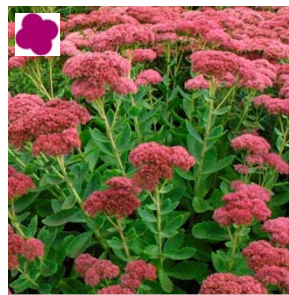
Sedum 'Autumn Fire'