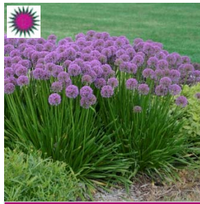
Allium 'Summer Beauty'