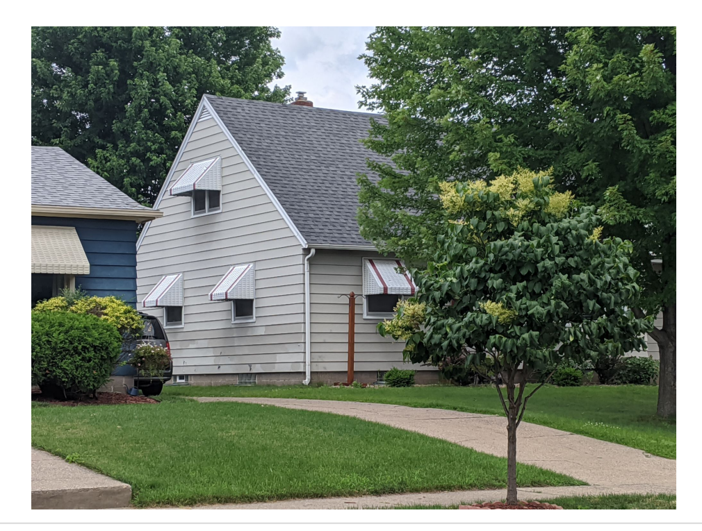
Uploaded: 8/5/2020 Kevin Conroy