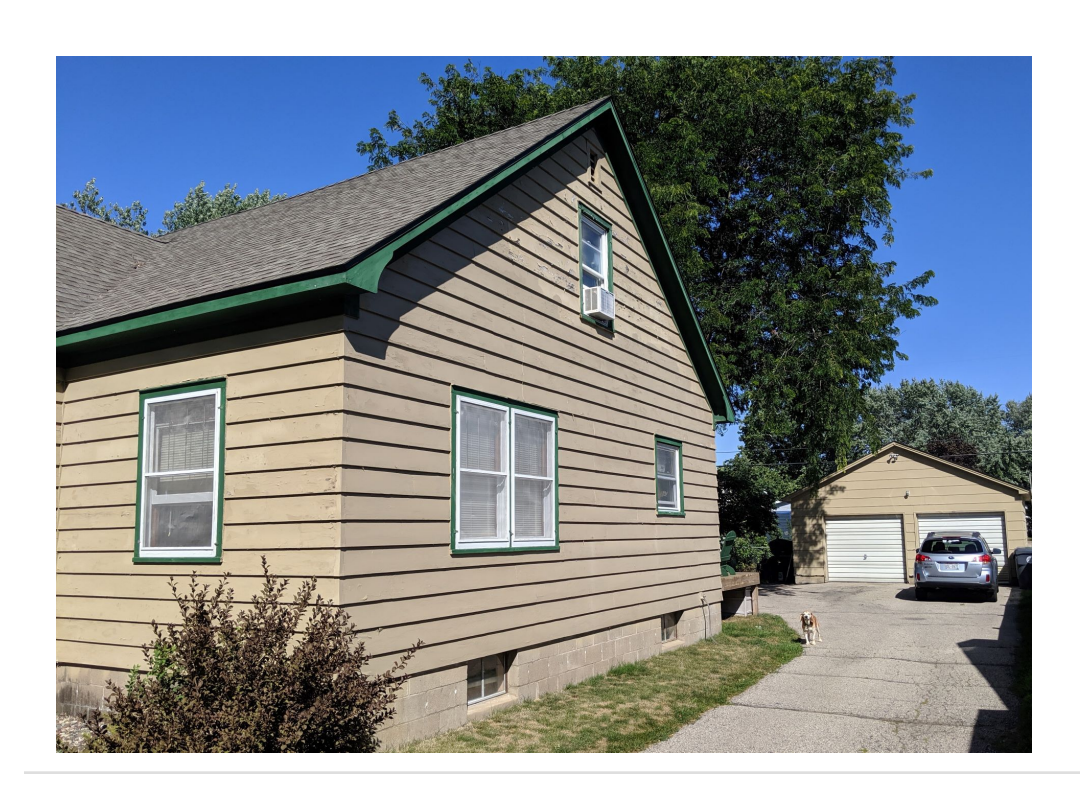
Uploaded: 9/4/2019 Kevin Conroy