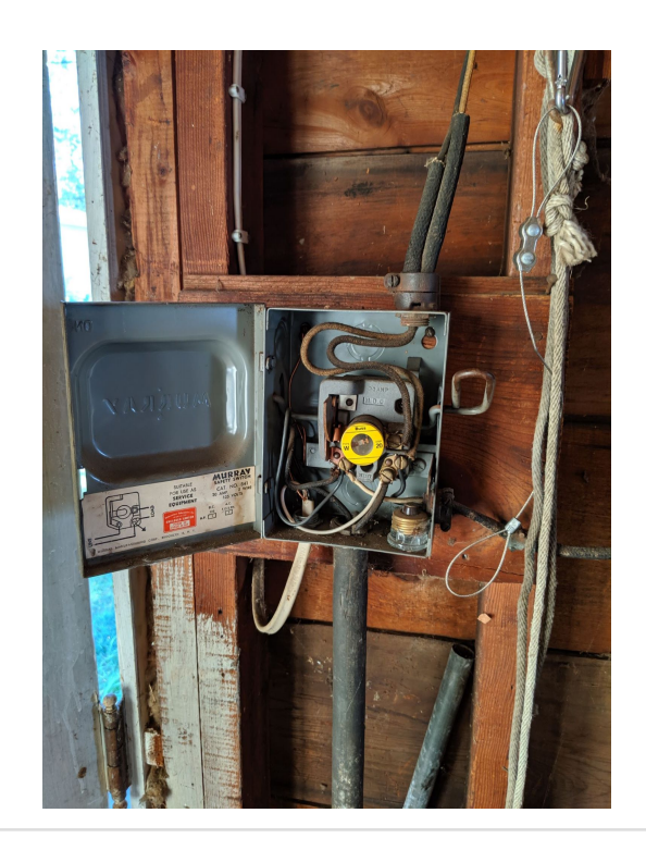
Uploaded: 9/4/2019 Kevin Conroy