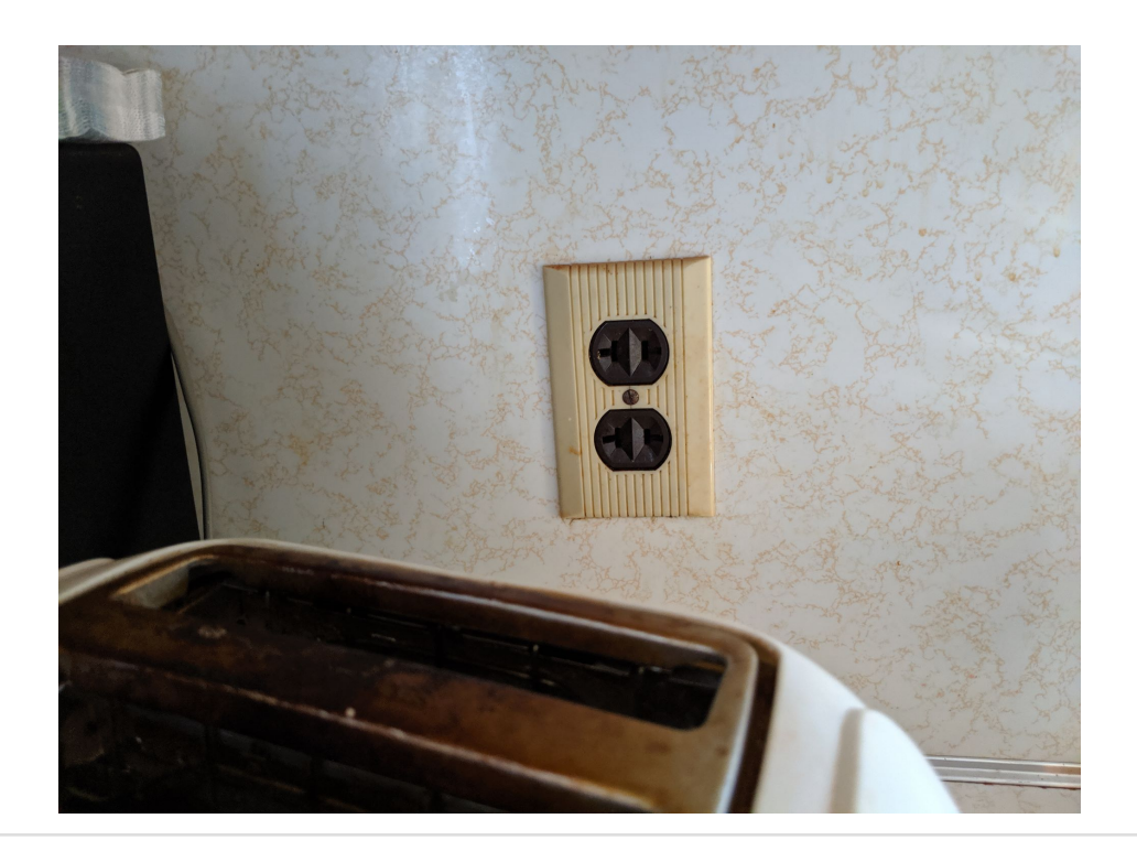
Uploaded: 9/4/2019 Kevin Conroy