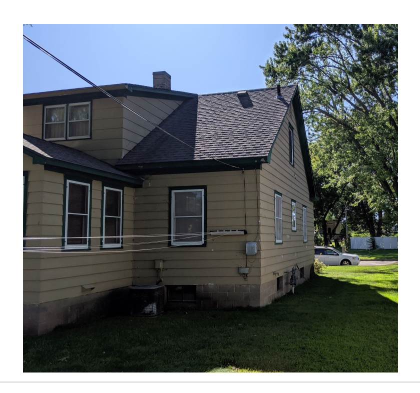
Uploaded: 9/4/2019 Kevin Conroy