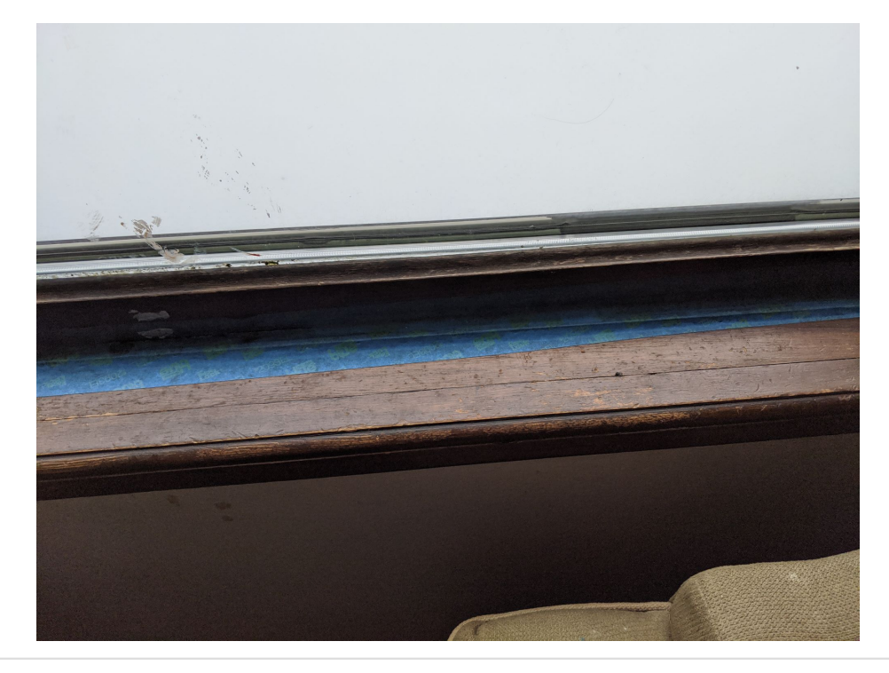
Uploaded: 4/24/2020 Kevin Conroy