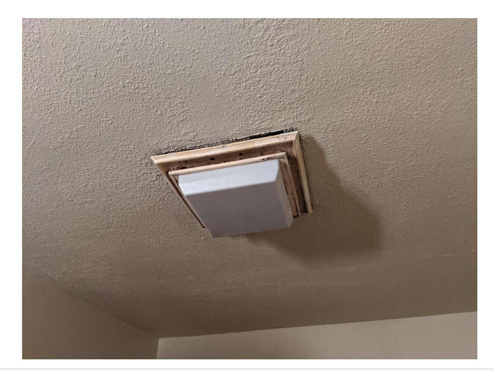
Uploaded: 4/24/2020 Kevin Conroy