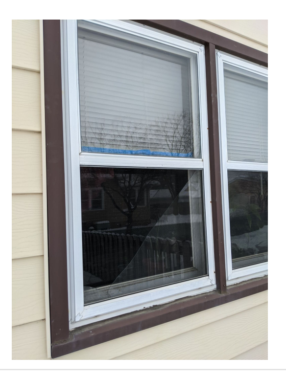
Uploaded: 4/24/2020 Kevin Conroy